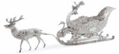
PROPERTY FROM AN OREGON ESTATE 76 A GERMAN 800 STANDARD SILVER REINDEER AND SLEIGH WITH PUTTI marked with crescent and crown, 20th century Repousse style sleigh, putti broken off and retained, total length 14 1/2in (36.75cm), total silver weight approximately 17.5oz troy. $600 - 800