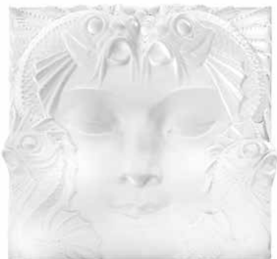
378 A LALIQUE MOLDED FROSTED GLASS PLAQUE: MASQUE DE FEMME W Late 20th century signed Lalique © France. height 12 1/2in (31.7cm); width 12 1/4in (31.2cm) $2,000 - 3,000