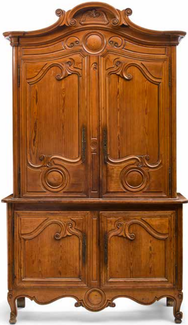
420 A LOUIS XV CARVED PINE BUFFET À DEUX CORPS W Late 18th century height 90in (228cm); width 57 1/2in (146cm); depth 20 1/4in (51cm) $2,500 - 3,500