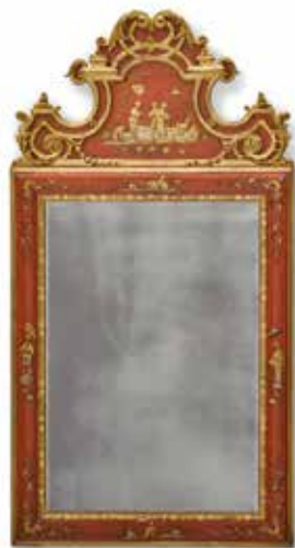
583 A LOUIS XVI STYLE CHINOISERIE DECORATED RED PAINTED MIRROR W Early 20th century height 63in (160cm); width 33 1/2in (85cm) $2,500 - 3,500