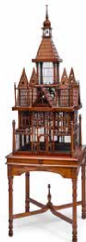
PROPERTY FROM THE JAMES FAMILY ESTATE, SEDONA, ARIZONA 291 A VICTORIAN STYLE MAHOGANY BIRDCAGE ON STAND W height 85in (215cm); width 27in (68cm), depth 27in (68cm) $2,000 - 3,000