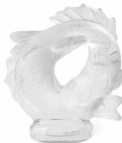
379 A LALIQUE MOLDED FROSTED GLASS SCULPTURE: DEUX POISSONS Late 20th century signed Lalique © France. height 11in (27cm) $1,200 - 1,800