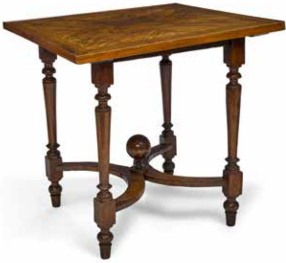
414 A CONTINENTAL BAROQUE STYLE WALNUT TABLE

W 18th century and later height 30 1/4in (76cm); 31 1/2in (80cm), square $1,000 - 1,500