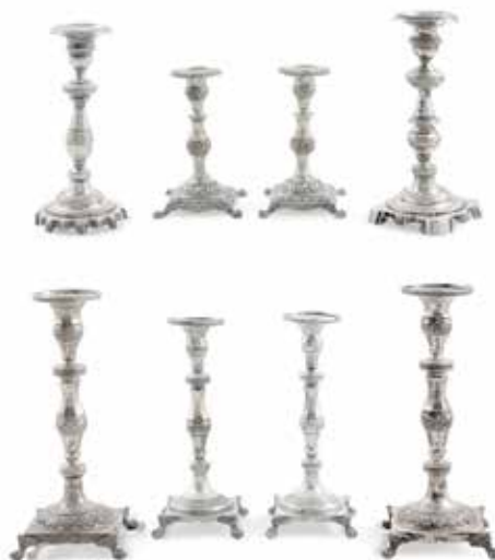
81 FIVE CONTINENTAL SILVER PAIRS OF CANDLESTICKS by various makers The tallest pair 11in (28cm). $800 - 1,200