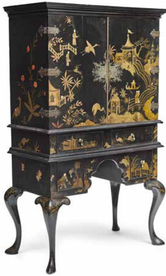
222 A GEORGE II STYLE CHINOISERIE DECORATED BLACK LACQUERED WOOD CABINET ON STAND W Late 19th/early 20th century height 67 1/2in (171cm); width 40in (101cm); depth 22 1/2 (57cm) $4,000 - 6,000