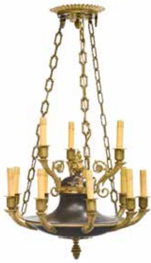
490 AN EMPIRE GILT BRONZE AND PATINATED METAL TWELVE LIGHT CHANDELIER W 19th century Later electrified. height 44in (111cm); diameter 22in (55cm) $2,000 - 4,000