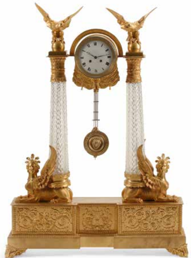
194 AN EMPIRE STYLE GILT BRONZE AND CUT GLASS MANTLE CLOCK W height 44in (111cm); width 32 1/2in (82cm); depth 7in (17cm) $6,000 - 8,000