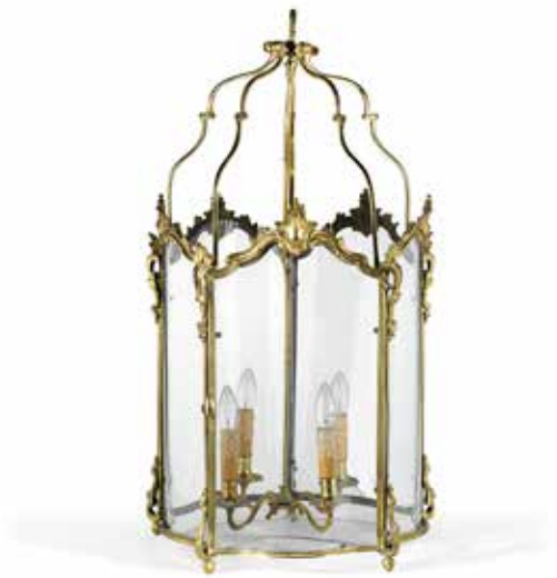
PROPERTY OF A PRIVATE SAN FRANCISCO BAY AREA COLLECTOR 491 A LOUIS XV STYLE GILT BRONZE AND GLASS LANTERN W Second quarter 20th century Lacking one glass panel. height 33in (84cm) $2,000 - 3,000