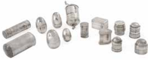
34 AN ASSEMBLED GROUP OF FOURTEEN ENGLISH AND CONTINENTAL SILVER NUTMEG GRINDERS by various makers, 18th century and later Including a cylinder form grinder, mark of George Unite, Birmingham, 1859; a box form grinder, mark of Joseph Wilmore, Birmingham, 1806; an egg-form grater, mark of William Southey, London, 1810, the largest length 3in (8cm) , total silver weight approximately 10oz troy. $1,500 - 2,000