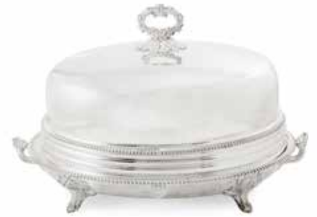
53 A GEORGIAN SILVERPLATE WELL-AND-TREE MEAT DISH AND DOME by R. Gainsford, Sheffield, first half 19th century Length over handles 26 1/2in (67cm). $800 - 1,200