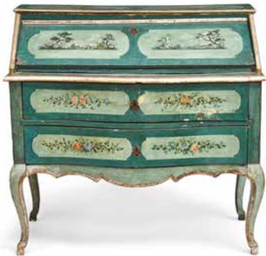
348 AN ITALIAN ROCOCO PAINTED DEOCRATED WOOD SLANT FRONT DESK W 18th century height 41 1/2in (105cm); width 43 1/2in (110cm); depth 21in (53cm) $3,000 - 5,000