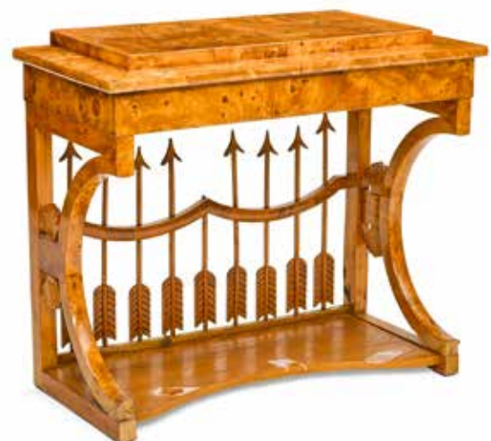
PROPERTY OF VARIOUS OWNERS 413 A RUSSIAN NEOCLASSICAL KARELIAN BIRCH CONSOLE W Early 19th century height 30 1/2in (77cm); width 34 1/2in (88cm); depth 17 1/2in (44cm) $1,500 - 2,000