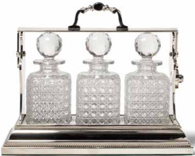
PROPERTY OF ANOTHER OWNER 740 A BETJEMANN'S SILVER PLATE AND CUT GLASS TANTALUS Impressed crown mark BETJEMANN'S PATENT 13818 LONDON. height 13in (33cm); length 16 1/4in (41.4cm) $800 - 1,200