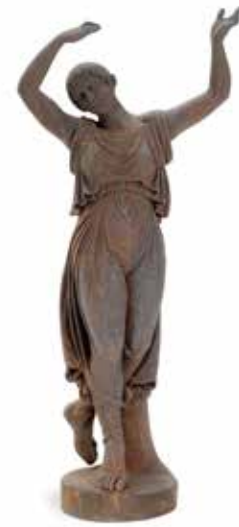
561 A CONTINENTAL CAST IRON FIGURE OF A DANCING MAIDEN W height 48in (121cm) $1,000 - 1,500