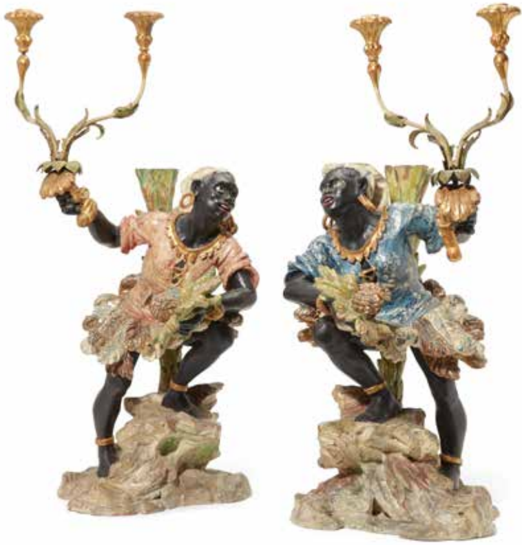
604 A PAIR OF ITALIAN POLYCHROMED CARVED WOOD AND METAL FIGURAL TWO LIGHT CANDELABRA W 18th/19th century height of largest 33 1/2in (85.5cm) $3,000 - 5,000