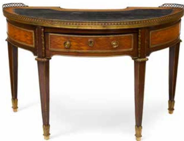
PROPERTY FROM AN OREGON ESTATE 412 A RUSSIAN NEOCLASSICAL STYLE GILT BRONZE MOUNTED PARQUETRY INLAID MAHOGANY WRITING DESK W 19th century height 29in (73cm); width 43in (109cm); depth 25in (63cm) $2,000 - 3,000