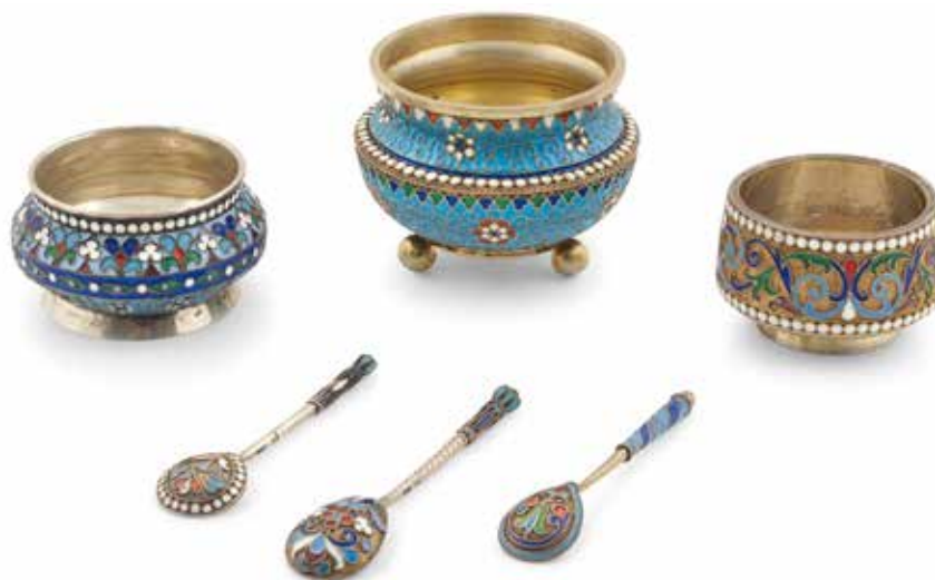
64 THREE SETS OF RUSSIAN SILVER AND ENAMEL SALT CELLARS AND SPOONS by various makers, late 19th and early 20th century The largest height 2in (5cm). $1,500 - 3,000