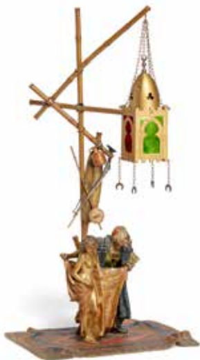
676 A VIENNA COLD PAINTED BRONZE FIGURAL LAMP Bergman foundry, early 20th century Impressed B 691 GESHUTZT in an urn mark and MADE IN AUSTRIA. height 20in (51cm) $1,500 - 2,500