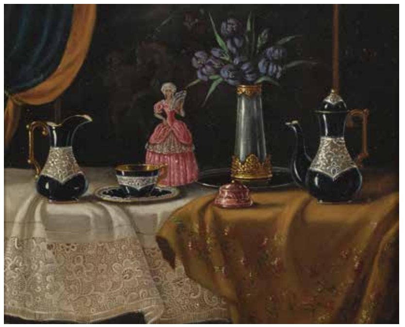
279 CONTINENTAL SCHOOL, 19TH CENTURY Elegant tables set for tea (a pair) both oil on panel each 8 1/2 x 10 1/2in (21 x 27cm) $2,000 - 3,000