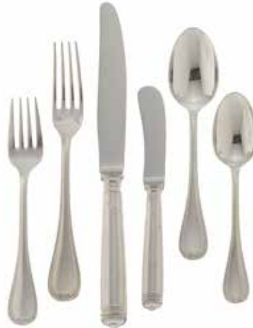
78 A FRENCH SILVER PLATED PARTIAL FLATWARE SERVICE Christofle, Paris, 20th century Malmaison pattern, comprising: 12 dinner knives, 12 dinner forks, 14 tablespoons, 13 teaspoons, 20 salad forks, 13 butter spreaders, and one place spoon. $600 - 800