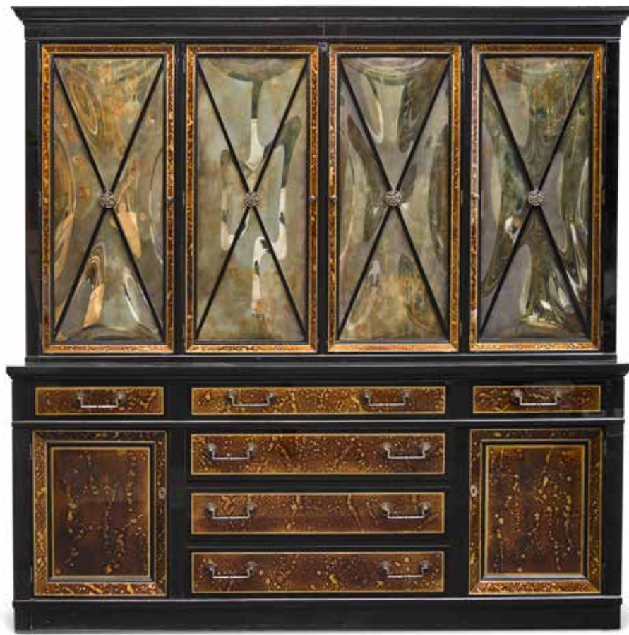
380 EBONIZED AND LACQUERED WOOD FOUR-WINDOW VITRINE W 1940s overall height 79 1/2in (202cm); width 78 1/2in (199cm); depth 19in (48cm) $3,000 - 5,000