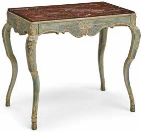
342 AN ITALIAN ROCOCO MARBLE TOP PAINTED WOOD TABLE W Second half 18th century height 28 1/2in (72cm); width 34 1/2in (87cm); depth 20 1/2in (52cm) $5,000 - 7,000