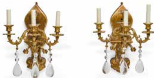
495 A PAIR OF FRENCH GILT BRONZE, GLASS, AND CHINOISERIE DECORATED GILTWOOD THREE LIGHT WALL SCONCES W SCONCES height 14 1/2in (36.5cm); width 13in (33cm) $1,000 - 1,500