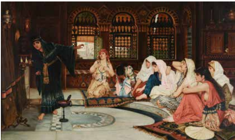
543 AFTER JOHN WILLIAM WATERHOUSE, RA, RI W Consulting the oracle bears signature 'N. Sichel.' (lower right) oil on canvas 31 x 52in (78.7 x 132cm) $3,000 - 5,000 For Provenance please refer to the online catalogue.