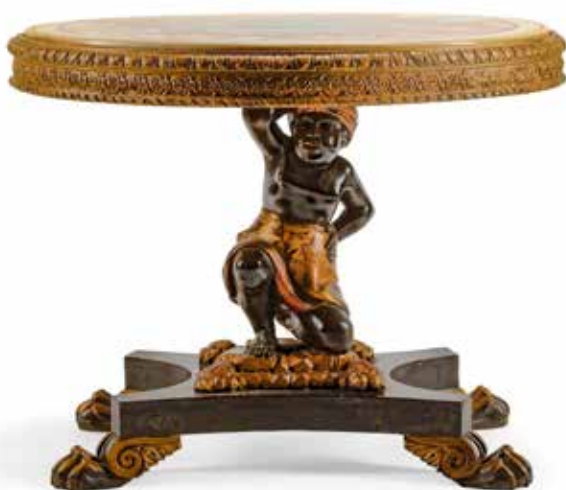
488 AN ITALIAN NEOCLASSICAL STYLE SPECIMEN MARBLE TOP PARCEL GILT AND EBONIZED WOOD CENTER TABLE W 19th century height 28in (71cm); diameter 34 1/2in (87cm) $4,000 - 6,000