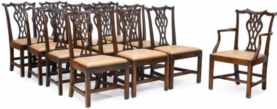
288 A SET OF TWELVE GEORGE III CARVED MAHOGANY DINNING CHAIRS W Fourth quarter 18th century Comprising one armchair and eleven side chairs. height of armchair 38 1/4in (97cm); width 23 3/4in (60cm); depth of seat 17in (43cm) $6,000 - 8,000