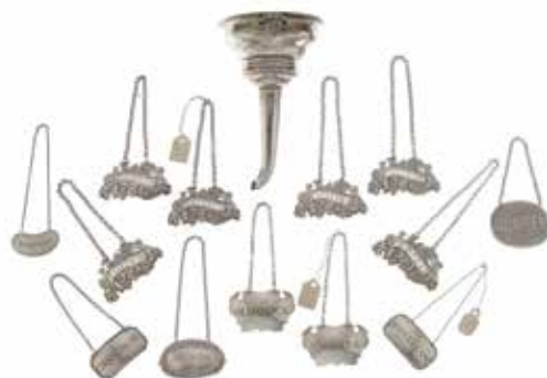
32 A COLLECTION OF SIX WILLIAM IV STERLING SILVER BOTTLE TICKETS Birmingham, 1836 Together with a wine funnel by Thomas Daniel, London, 1790 and an assembled group of seven silver and metalware bottle tickets, the funnel length 5 1/2in (14cm) (14). $1,200 - 1,800