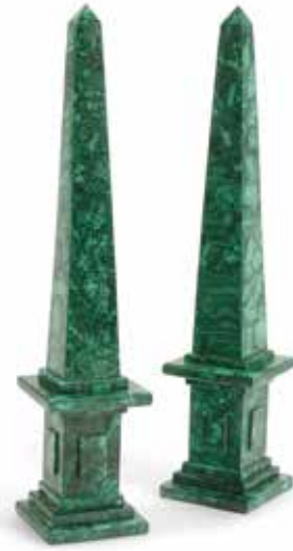
PROPERTY OF VARIOUS OWNERS 405 A PAIR OF MALACHITE OBELISKS W height 32in (81cm); width 6 1/2in (16cm); depth 6 1/2in (16cm) $2,500 - 3,500