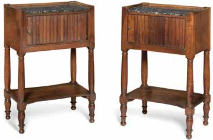
417 A PAIR OF LOUIS XVI STYLE MARBLE TOP WALNUT SIDE TABLES

W 20th century height 40in (101cm); width 30 in (76cm); depth 77in (195cm) $2,000 - 3,000