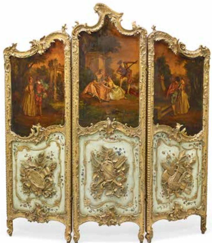
668 A ITALIAN ROCOCO STYLE PARCEL GILT AND PAINTED WOOD THREE PANEL W FLOOR SCREEN Fourth quarter 19th century height 68in (173cm); width 60in (152.3cm) $4,000 - 6,000