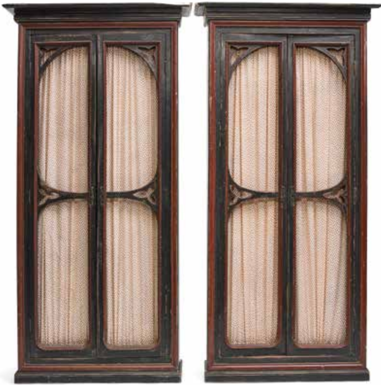
738 A PAIR OF GOTHIC STYLE PAINTED WOOD AND WIRE DOOR BIBLIOTHEQUES W 19th century height 93in (236cm); width 40in (101cm); depth 12 1/4in (31cm) $3,000 - 5,000