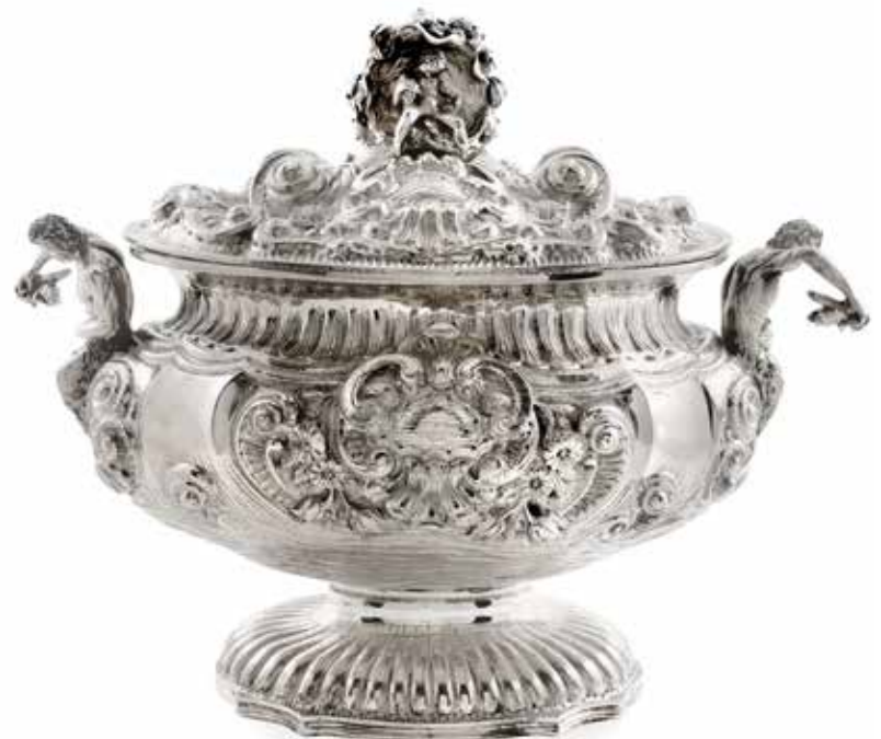
116 AN ITALIAN SILVER BAROQUE TUREEN with the mark of M.Buccellati, 20th Century With scrolling vines, figural handles and finial, length over handles 18 1/2in (47cm), total weight approximately 140oz troy. $5,000 - 7,000