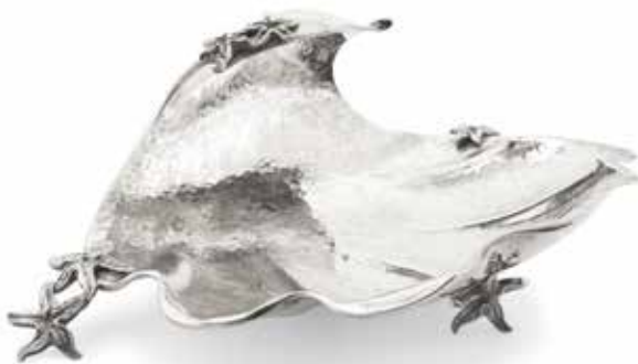
127 AN ITALIAN SILVER SHELL FORM DISH the mark of Buccellati, 20th Century On three starfish form feet, length 9 1/2in (24cm), total silver weight approximately 18.5oz troy. $800 - 1,200