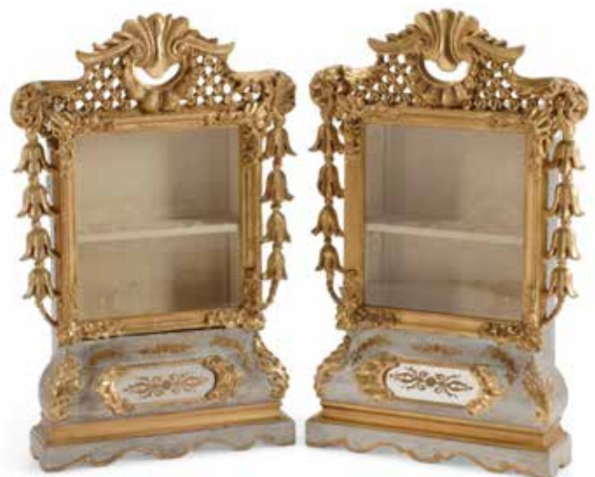
489 A PAIR OF ITALIAN ROCOCO STYLE PARTIAL SILVER GILT AND GILTWOOD TABLE CABINETS W 19th century height 34in (86cm); width 22in (55cm); depth 8in (20cm) $2,000 - 3,000