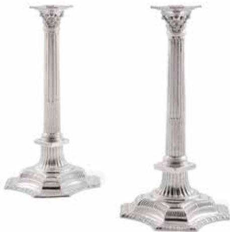
41 A PAIR OF GEORGE II SILVER COLUMN FORM CANDLESTICKS by John Cafe, London, 1756 and 1757 Length 13in (33cm), total silver weight approximately 33oz troy. $3,000 - 5,000