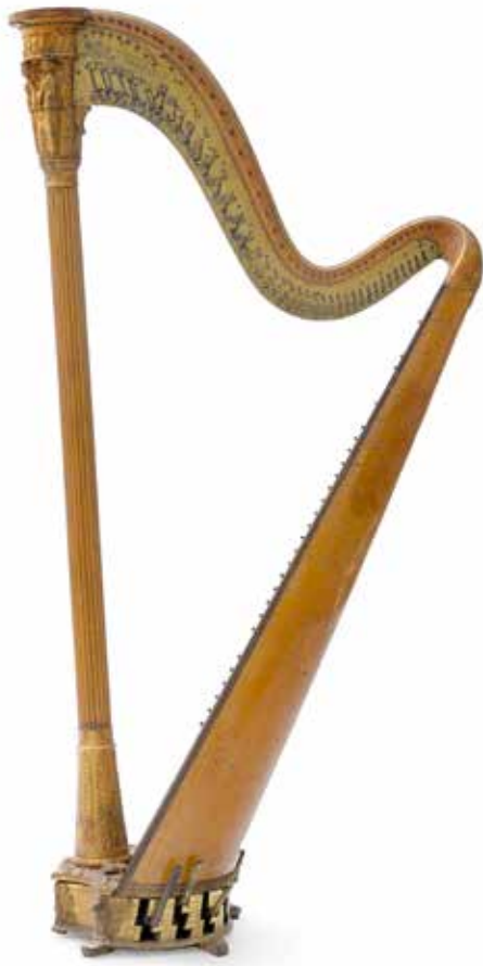
723 SEBASTIAN ERARD PARCEL GILT AND PAINTED FRUITWOOD HARP W Early 19th century With brass plaque inscribed Sebastian Erard, Patent N. 4417, 18 Great Marlborough, London. height 67in (144cm) $2,500 - 3,500