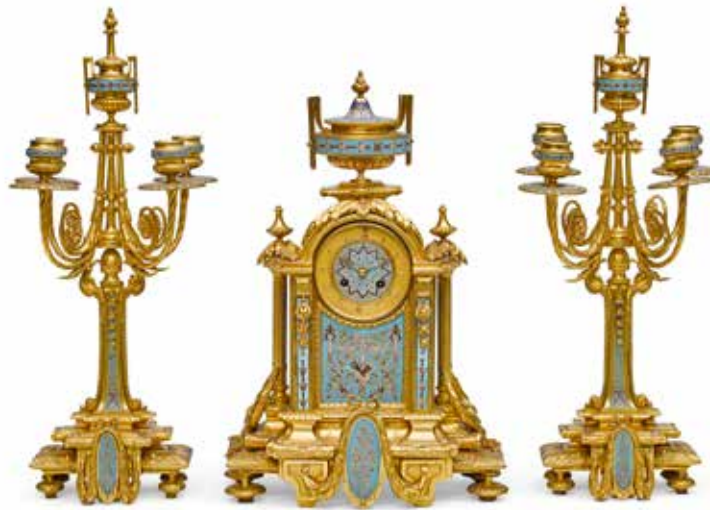
706 A FRENCH GILT BRONZE AND CHAMPLEVÉ ENAMEL THREE PIECE CLOCK GARNITURE W Late 19th/early 20th century height of clock 16 1/4in (41cm); height of candelabra 18 3/4in (47.5cm) $4,000 - 6,000