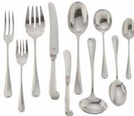
49 AN ENGLISH STERLING SILVER FLATWARE SERVICE by Worcester Silver Co. Inc., England, 20th Century Queen Anne pattern, comprising: 12 dinner knives, 12 dinner forks, 12 salad forks, 12 soup spoons, 12 place spoons, 12 teaspoons, 12 butter spreaders, and three serving pieces: a ladle, a spoon, and a fork total weighable silver approximately 131oz troy (87). $1,500 - 2,000