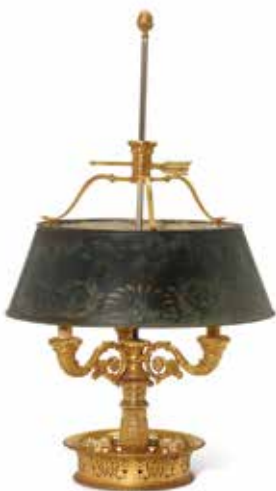
PROPERTY OF ANOTHER OWNER 660 AN EMPIRE STYLE GILT BRONZE AND TÔLE PEINTE THREE LIGHT BOUILLOTTE LAMP W 19th century Electrified. height 27 1/2in (70cm); diameter of shade 15 3/4in (40cm) $1,500 - 2,500