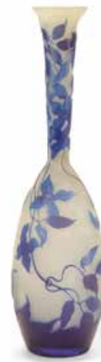
375 AN ÉMILE GALLÉ CAMEO GLASS BLUE CLEMATIS VASE circa 1900 signed Gallé. height 15in (38.2cm); diameter 4 1/2in (11cm) $1,000 - 1,500