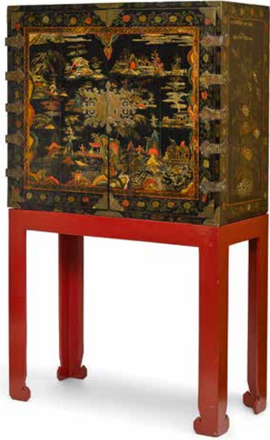
586 CHINOISERIE LACQUERED WOOD AND PATINATED METAL CABINET ON STAND W 20th century height overall 67in (170cm); width 40in (101.5cm); depth 18in (45.5cm); height of cabinet 34in (86cm); height of stand 33in (84cm) $1,800 - 2,500