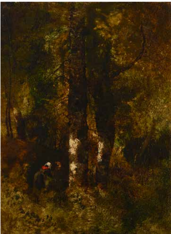
365 NARCISSE VIRGILE DIAZ DE LA PEÑA (FRENCH, 1808-1876) Boissière en forêt de Fontainebleau signed 'N. Diaz' (lower left) oil on panel 14 x 10 1/2 in (35.6 x 26.7 cm) $3,000 - 5,000 For Provenance please refer to the online catalogue.