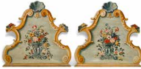
394 A PAIR OF ITALIAN ROCOCO STYLE PAINTED WOOD W HEADBOARDS 20th century height 41in (104cm); width 42 1/4in (108cm) $1,000 - 1,500