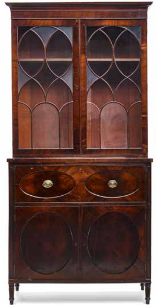
289 A GEORGE III MAHOGANY SECRETARY BOOKCASE W Late 18th century With a fitted interior. height 95in (241cm); width 44 3/4in (113cm); depth 23 1/2in (59cm) $2,000 - 4,000