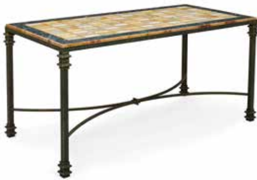
PROPERTY OF VARIOUS OWNERS 382 A SPECIMEN MARBLE AND WROUGHT IRON TABLE W Post 1950 height 33in (84cm); width 70 3/4in (180cm); depth 34 1/3in (87cm) $2,000 - 3,000