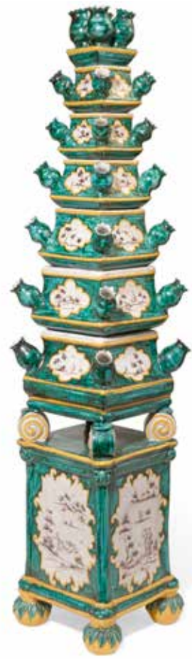
PROPERTY FROM AN OREGON ESTATE 739 A DUTCH STYLE FAÏENCE TULIPIERE W height 54 1/2in (138.5cm) $800 - 1,200