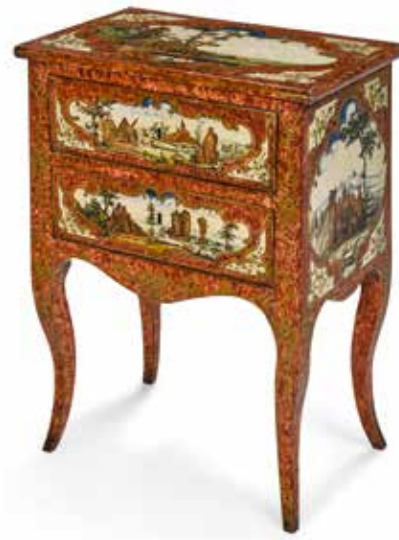
343 AN ITALIAN ROCOCO STYLE PAINT DECORATED WOOD COMMODINI W 18th/19th century height 31in (78cm); width 21 3/4in (55cm); depth 14in (35cm) $2,000 - 3,000