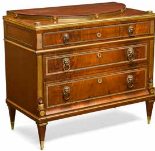
411 A RUSSIAN NEOCLASSICAL STYLE BRASS MOUNTED MAHOGANY COMMUNE W Late 19th century height 33 1/2in (85cm); width 37in (93cm); depth 18 1/2in (46cm) $4,000 - 6,000