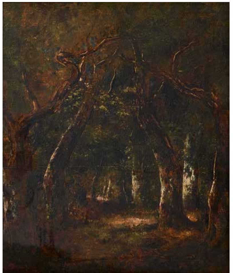
366 NARCISSE VIRGILE DIAZ DE LA PEÑA (FRENCH, 1808-1876) Morning sun in the forest in Fontainebleau signed and indistinctly dated 'N. Diaz.' (lower left) oil on paper laid down on panel 12 1/2 x 11 in (31.8 x 28.5 cm) $2,000 - 3,000 For Provenance please refer to the online catalogue.