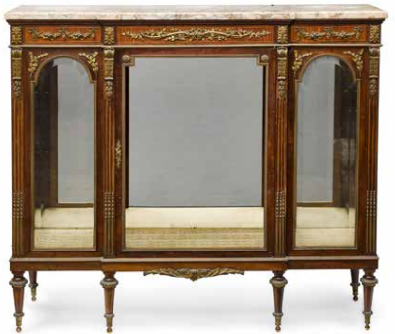
PROPERTY OF MARY CHASE COMSTOCK 627 A LOUIS XVI STYLE MARBLE TOP GILT METAL MOUNTED MAHOGANY VITRINE W 20th century height 47in (119cm); width 52in (132cm); depth 16 1/5in (41cm) $2,000 - 3,000