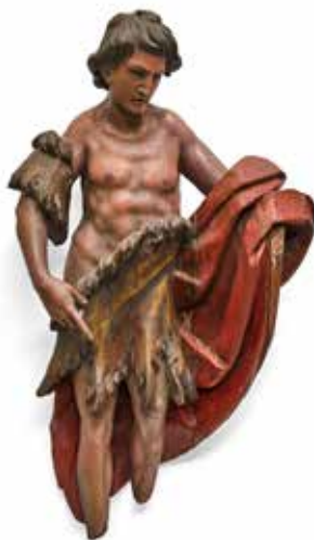
602 A CONTINENTAL CARVED AND POLYCHROMED WOOD FIGURE OF SAINT JOHN THE BAPTIST 19th century height 49 1/4in (125.5cm); width 28in (71cm) $600 - 800