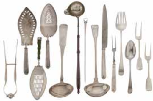
35 AN ASSEMBLED COLLECTION OF TWELVE ENGLISH STERLING SILVER SERVING FLATWARE PIECES by various makers, 18th-19th Century together with an American soup ladle and an unmarked meat skewer (14). $1,500 - 2,000