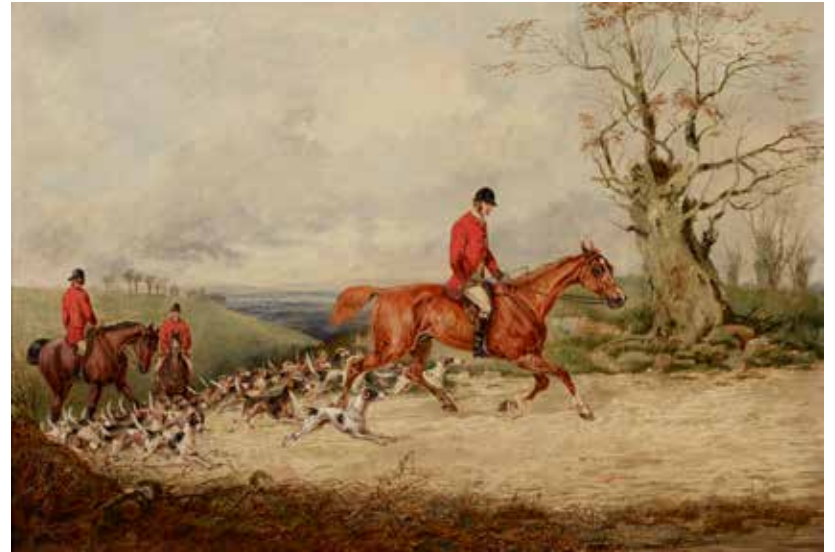
276 SAMUEL HENRY GORDON ALKEN, JR. (BRITISH, 1810-1894) Going to covert; Returning home (a pair) the first signed 'H Alken' (lower right); the second signed 'H Alken' (lower left) both oil on board both 12 x 18in (30.5 x 45.8cm) $6,000 - 8,000 For Provenance please refer to the online catalogue.