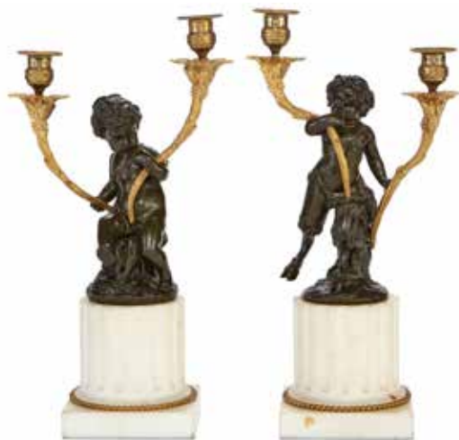
PROPERTY OF A PRIVATE SAN FRANCISCO BAY AREA COLLECTOR 609 A PAIR OF LOUIS XVI STYLE GILT, PATINATED BRONZE AND MARBLE TWO LIGHT CANDELABRA After Clodion, fourth quarter 19th century Inscribed Clodion . height 18 3/4in (47.5cm) $1,000 - 1,500