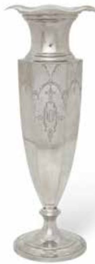
11 AN AMERICAN WEIGHTED STERLING SILVER VASE by Shreve & Co., San Francisco, CA, early 20th Century Height 16in (40.5cm); diameter at base 5in (12.5cm). $800 - 1,200