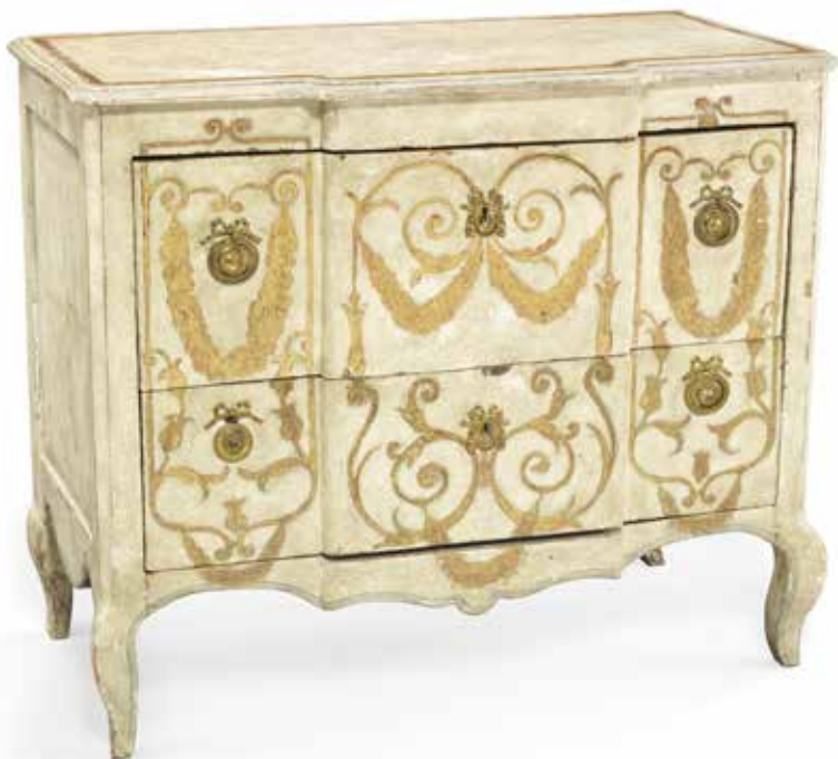
PROPERTY OF A PRIVATE SAN FRANCISCO BAY AREA COLLECTOR 667 AN ITALIAN NEOCLASSICAL PARCEL GILT, PAINTED AND ETCHED PASTIGLIA W COMMODE Fourth quarter 18th century height 33in (84cm); width 38in (96.5cm); depth 19 1/2in (49.5cm) $2,000 - 3,000