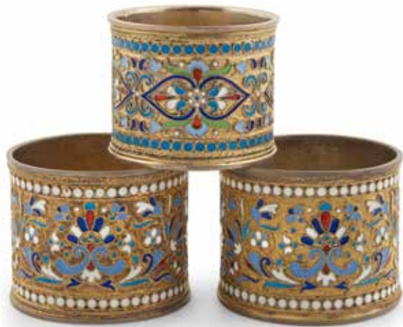
62 PROPERTY OF VARIOUS OWNERS THREE RUSSIAN SILVER AND ENAMEL NAPKIN RINGS Early 20th century The largest diameter 2in (5cm). $1,500 - 2,000