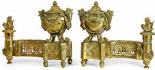
614 A PAIR OF LOUIS XVI STYLE GILT BRONZE CHENETS Fourth quarter 19th century Signed Morisot . height 13 1/2in (34cm); length 16in (40cm) $1,000 - 1,500