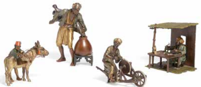
677 A GROUP OF FOUR VIENNA COLD PAINTED BRONZE FIGURES Early 20th century One impressed AUSTRIA. heights 3 3/4in to 6 1/8in (9.5cm to 15.5cm) $1,500 - 2,500