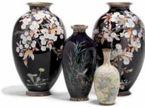
575 A GROUP OF FOUR JAPANESE CLOISSONNÉ VASES 20th century heights 7in to 12 1/4in (18.5cm to 31cm) $1,200 - 1,800