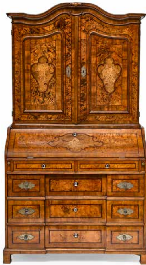
247 A CONTINENTAL INLAID WALNUT SECRETARY CABINET W 18th/19th century height 83in (210cm); width 45in (114cm); depth 23in (58cm) $7,000 - 10,000