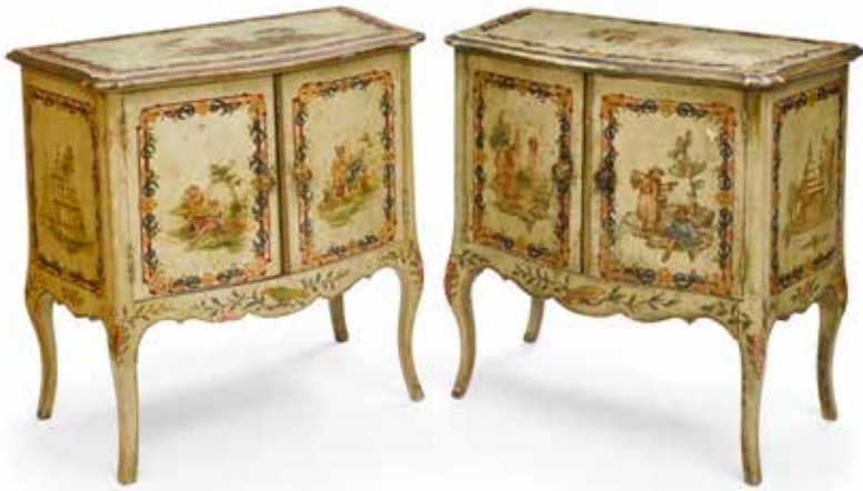
344 A PAIR OF ITALIAN ROCOCO STYLE PAINTED AND DECORATED WOOD SIDE CABINETS W Late 19th century height 27 3/4in (70cm); width 27 1/2in (69cm); depth 14 1/4in (36cm) $1,500 - 2,500