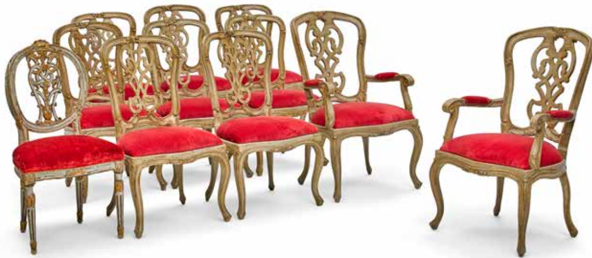
485 AN ASSEMBLED SET OF TEN ITALIAN ROCOCO STYLE PAINTED WOOD DINING CHAIRS AND A SIMILAR CHAIR W 19th century and later, single chair 18th century Including two armchairs. height of armchairs 39in (99cm); width 23 1/2in (59cm); depth 23in (57cm) $5,000 - 7,000