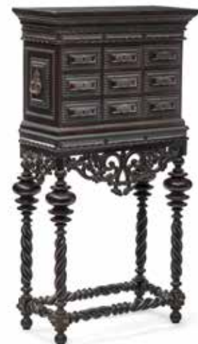
PROPERTY OF MARY CHASE COMSTOCK 594 PORTUGUESE BAROQUE STYLE WALNUT CABINET ON STAND W 19th century height 53in (124cm); width 27 1/2in (69cm); depth 13in (33cm) $3,000 - 5,000