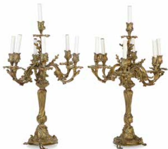
611 A PAIR OF LOUIS XV STYLE GILT BRONZE SIX LIGHT CANDELABRA W Late 19th century Now electrified. height excluding fittings 27in (68.5cm) $2,000 - 3,000