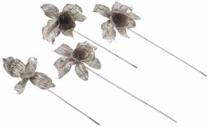
124 A SET OF FOUR ITALIAN STERLING SILVER IRISES retailed by Cartier length of largest 13 1/2in (34.5cm); total weighable silver 17oz troy. $2,000 - 3,000