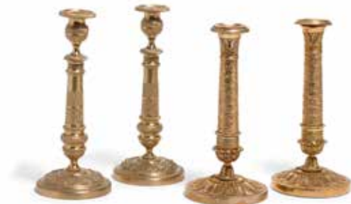
PROPERTY FROM AN OREGON ESTATE 608 TWO PAIRS OF FRENCH NEOCLASSICAL STYLE GILT METAL CANDLESTICKS heights 10 1/2in and 11in (26.5cm and 28cm) $800 - 1,200