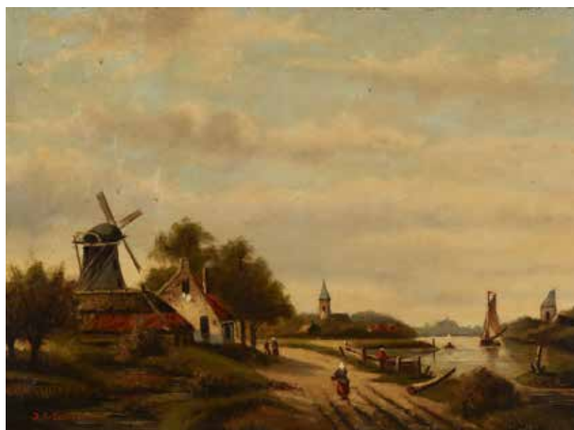
448 J. C. CORVER (DUTCH, 19TH CENTURY) A summer landscape with figures along a canal near a windmill signed 'J. C. Corver.' (lower left) oil on board 12 3/4 x 17 1/4in (32.4 x 43.8cm) $2,500 - 3,500 For Provenance please refer to the online catalogue.