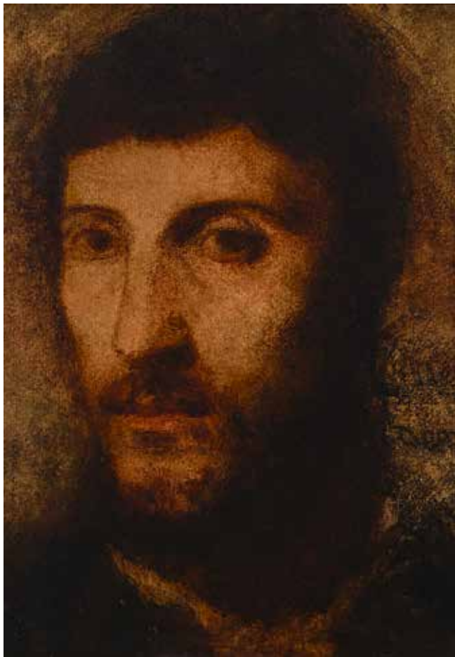
367 HENRI FANTIN-LATOURE (FRENCH, 1836-1904) La tête du portrait d'homme, d'après Titian oil on paper laid down on canvas 13 1/2 x 9 3/4 in (34.3 x 24.8 cm) $3,000 - 5,000 For Provenance please refer to the online catalogue.