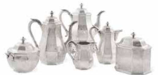
9 AN AMERICAN SILVER SIX PIECE TEA AND COFFEE SERVICE by William Forbes, New York, circa 1840, Retailed by Ball, Tompkins & Black, Successors to Marquand & Co. Comprising: a tea pot, a coffee pot on an octagonal footed stand, a tea caddy, a milk pot, a cream jug, and a sugar dish, total silver weight approximately 132oz troy. $2,500 - 3,500