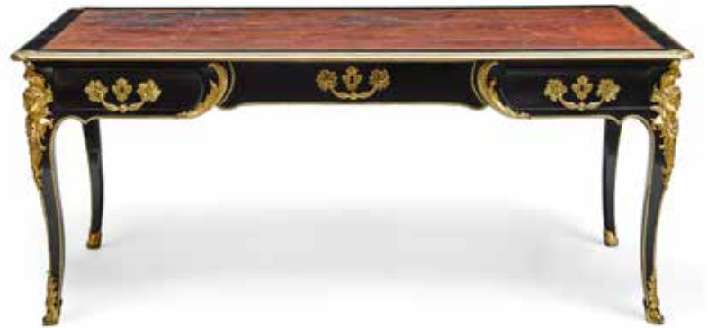
209 A LOUIS XV STYLE GILT BRONZE MOUNTED AND EBONIZED WOOD BUREAU PLAT W 19th century height 30 3/4in (78cm); width 70in (177cm); depth 34 1/2in (87cm) $8,000 - 12,000