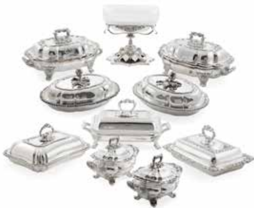
31 AN ASSEMBLED GROUP OF ENGLISH SILVERPLATE SERVING PIECES by Various makers, 19th-20th century Comprising: a entree dish; a pair of Georgian sauce tureens; a pair of Georgian vegetable dishes; a Victorian centerbowl; and two Victorian covered entree dishes, the two-handed entree dish length 14 1/2in (37cm), width 9in (23cm) (8). $1,000 - 1,500