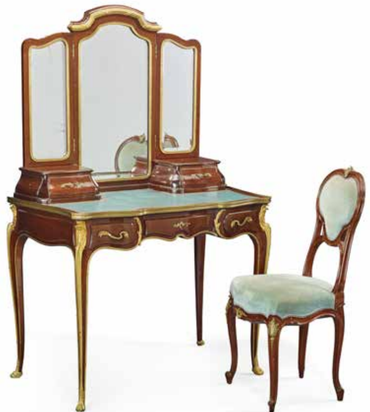
PROPERTY OF A PRIVATE SAN FRANCISCO BAY AREA COLLECTOR 643 A LOUIS XV STYLE GILT BRONZE MOUNTED MAHOGANY DRESSING TABLE W TOGETHER WITH A LOUIS XV STYLE GILT BRONZE MOUNTED MAHOGANY CHAIR Late 19th century height of table 62 1/2in (159cm); width 37 3/4in (96cm); depth 23in (58.5cm); height of chair 37in (94cm); width 17in (43cm); depth 16 1/4in (41.3cm) $3,000 - 5,000