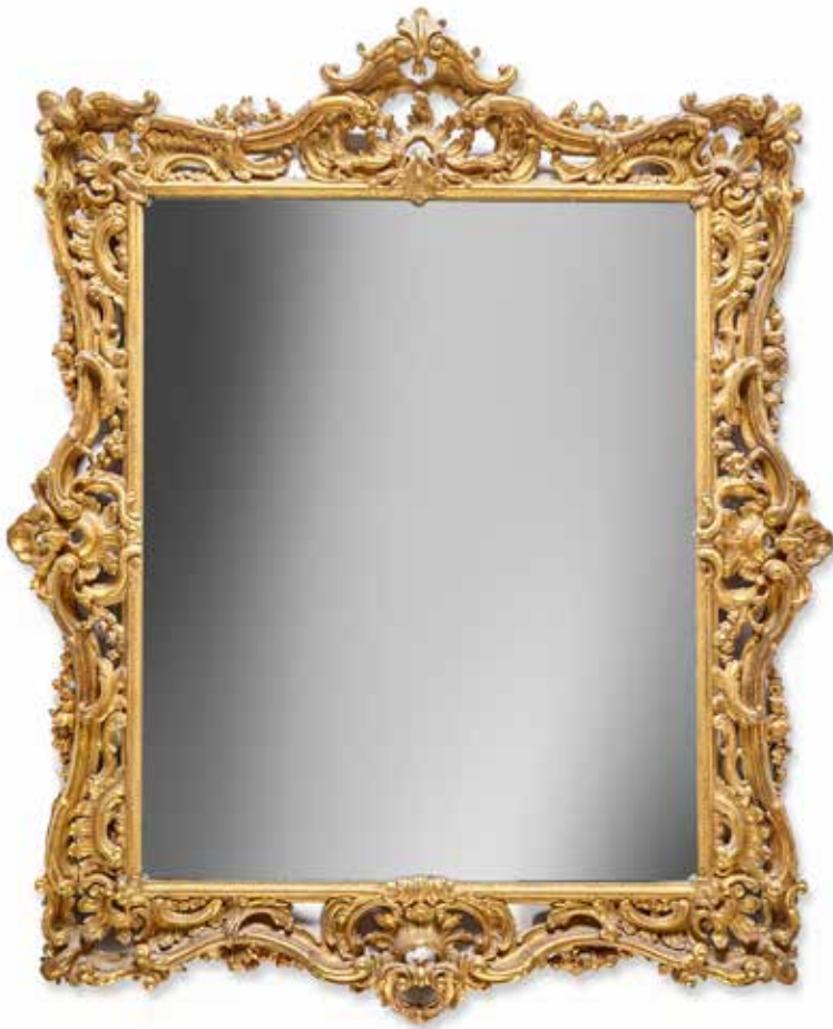
640 A LOUIS XV STYLE GILTWOOD MIRROR W Fourth quarter 19th century height 72in (183cm); width 57in (145cm) $3,000 - 5,000