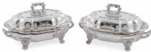
54 A PAIR OF ENGLISH SILVERPLATE COVERED ENTREE DISHES by T.& J. Creswick, Sheffield, 19th century Length over handles 14in (36cm); width 10in (25cm). $800 - 1,200