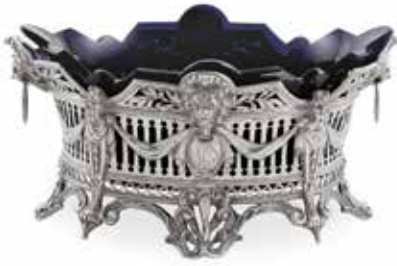
PROPERTY OF ANOTHER OWNER 74 A GERMAN STERLING SILVER NEOCLASSIC STYLE TWO-HANDLED OVAL RETICULATED CENTERPIECE late 19th/early 20th century With cobalt glass liner, length 11in (28cm), total silver weight approximately 27oz troy. $500 - 700