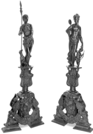
PROPERTY OF VARIOUS OWNERS 617 A PAIR OF RENAISSANCE STYLE PATINATED BRONZE FIGURAL ANDIRONS DEPICTING VENUS & ADONIS After models by Alessandro Vittoria (Venetian, 1525-1608) greatest height to tip of Adonis's spear 46 3/4in (119cm) $2,000 - 3,000