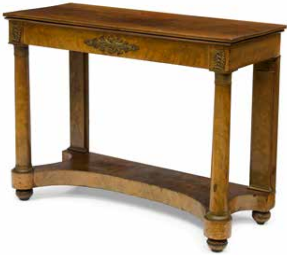
656 AN EMPIRE BRONZE MOUNTED MAHOGANY CONSOLE W 19th century With a later associated top. height 35in (88cm); width 44in (111cm); depth 18in (45cm) $1,000 - 2,000