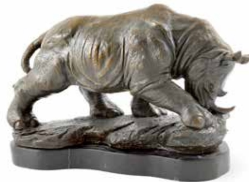
295 A PATINATED BRONZE FIGURE OF A RHINOCEROS Late 20th century On black marble base. height 7 1/2in (19cm); length 13in (33cm) $600 - 800