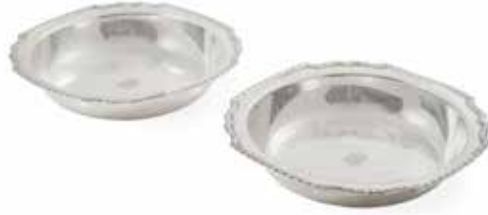
26 A PAIR OF AMERICAN STERLING SILVER VEGETABLE BOWLS by Tiffany & Co., New York, NY, 19th/20th century Rim with chased floral border, each dish with central monogram, diameter 10in (25cm), total silver weight approximately 36oz troy. $800 - 1,200