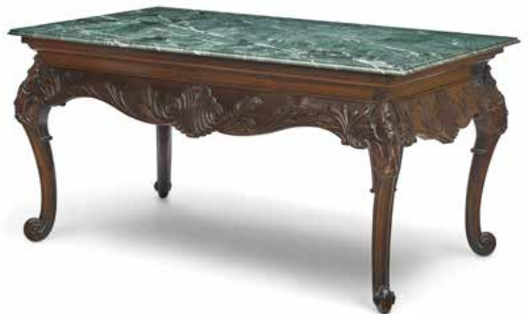
516 A GEORGE II STYLE MARBLE TOP MAHOGANY CENTER TABLE W 20th century height 31 1/2in (80cm); width 64in (162cm); depth 36in (91cm) $4,000 - 6,000