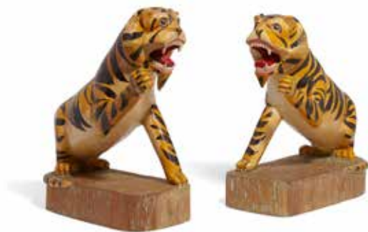
293 A PAIR OF CARVED AND PAINTED WOOD TIGERS height 17 1/4in (44cm) $800 - 1,200