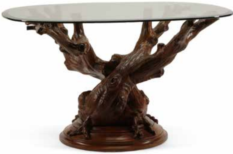
589 A RUSTIC GROTTTO STYLE GLASS TOP AND CARVED WALNUT TABLE W height 28in (71cm); width 48in (121cm); depth 48in (121cm) $2,500 - 3,500