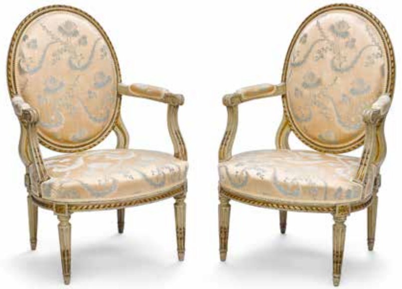
PROPERTY OF VARIOUS OWNERS 641 A PAIR OF LOUIS XVI PARCEL GILT AND PAINTED WOOD FAUTEUILS W Late 18th century height 39in (99cm); width 26in (66cm); depth 23in (58cm) $4,000 - 6,000