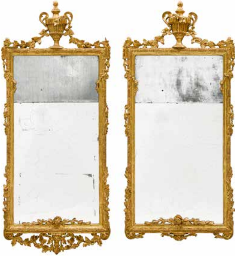
208 A PAIR OF LOUIS XVI STYLE GILTWOOD MIRRORS W 19th century height 69in (175cm); width 32in (81cm) $10,000 - 15,000