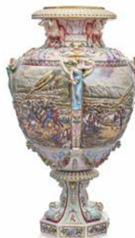
PROPERTY OF VARIOUS OWNERS 428 A MASSIVE CAPODIMONTE PORCELAIN NAPOLEONIC BATTLE SCENE VASE W Underglaze blue crowned N. height 32 1/4in (82cm) $2,000 - 3,000