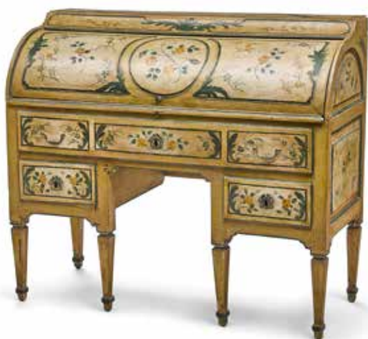
349 A CONTINENTAL NEOCLASSICAL STYLE PAINTED CYLINDER DESK W Composed of 18th century and later elements height 41in (104cm); width 46 1/4in (117cm); depth 19 3/4in (50cm) $1,500 - 2,000