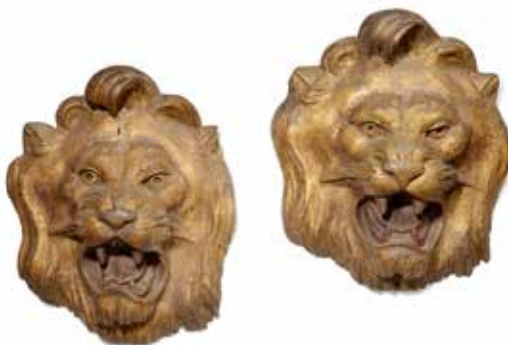
300 A PAIR OF CONTINENTAL CARVED AND GILTWOOD LION MASKS 19th century height 21 1/2in (55cm) $2,000 - 3,000