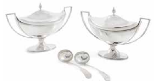
33 A PAIR GEORGE II STERLING SILVER SAUCE TUREENS by Henry Chawner and John Emes, London, 1797 With associated ladles by William Withers, the tureen length 9 1/2in (23cm); total silver weight of tureens and spoons approximately 30oz troy. $1,500 - 2,000