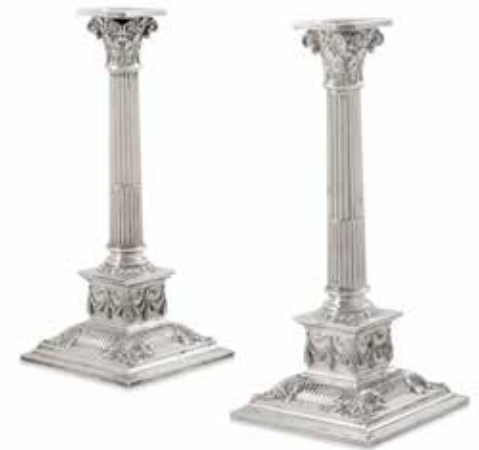
PROPERTY FROM AN OREGON ESTATE 18 A PAIR OF NEOCLASSICAL STYLE STERLING SILVER WEIGHTED CANDLESTICKS by Frank W. Smith Silver Co., Gardner, Massachusetts, 20th century height 11 1/2in (29cm). $800 - 1,200