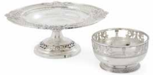
3 AN AMERICAN STERLING SILVER FOOTED AND RETICULATED COMPOTE by Redlich & Co., New York, NY, 20th century Together with a standard 800 silver sugar bowl, with reticulated griffons and a fitted glass insert, the compote diameter 10in (25cm), total silver weight approximately 23oz troy. $800 - 1,200