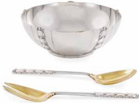
2 AN AMERICAN STERLING SILVER "TOMATO OR PUMPKIN VINE" SALAD BOWL AND PAIR OF MATCHING PARTIAL-GILT SALAD SERVERS Designed by Olaf Wilford for Tiffany & Co., New York, New York, Marked 22888 M, circa 1940 Diameter of bowl 9 1/2in (24cm), total silver weight approximately 33oz troy. $1,500 - 2,000