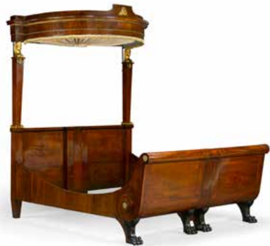
PROPERTY OF A PRIVATE SAN FRANCISCO BAY AREA COLLECTOR 661 AN EMPIRE STYLE PARCEL GILT AND EBONIZED MAHOGANY LIT DE BATEAU W Early 19th century and later height 102 1/2in (260cm); length 95 1/2in (243cm); width 79 1/4in (202cm) $3,000 - 5,000