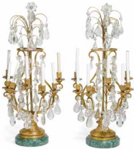
PROPERTY OF ANOTHER OWNER 404 A PAIR OF LOUIS XVI STYLE GILT BRONZE, ROCK CRYSTAL AND MALACHITE W VENEERED SEVEN LIGHT GIRANDOLES greatest height 41 1/4in (105cm); greatest width 18 1/2in (47cm) $3,000 - 5,000