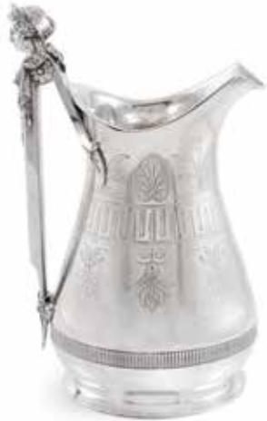
4 AN AMERICAN STERLING SILVER PITCHER Gorham Mfg. Co., Providence, RI, late 19th century Figural handle, Neoclassical border, footed base, height 12in (40.5cm); length over handle 8 1/2in (21.5cm), total silver weight approximately 45oz troy. $1,500 - 2,000