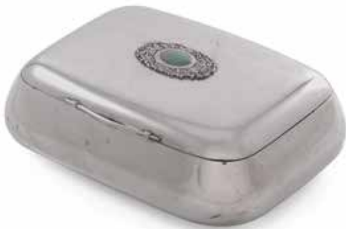
125 AN ITALIAN SILVER BOX with the mark of Buccellati, 20th Century With a central malachite cabochon applied to the lid, length 8 1/2in (21.5cm); width 6 1/2in (16.5cm), total silver weight approximately 22oz troy. $1,500 - 2,000