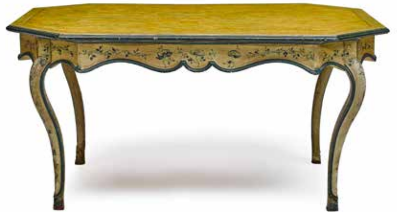
345 AN ITALIAN ROCOCO STYLE FAUX MARBLE AND PAINTED WOOD TABLE W 20th century, including antique elements height 31 1/2in (80cm); width 63 1/2in (158cm); depth 42 1/4in (114cm) $1,500 - 2,000