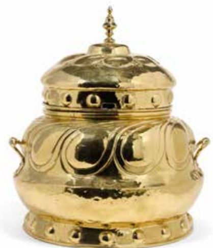
PROPERTY FROM AN OREGON ESTATE 621 A REPOUSSÉ BRASS BRAZIER 20th century height 19in (48cm); diameter 15in (38cm) $1,200 - 1,800