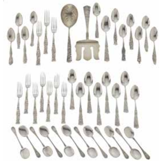
27 AN ASSEMBLED GROUP OF AMERICAN STERLING SILVER FLATWARE AND SERVING PIECES by George W. Shiebler, New York, NY, late 19th/early 20th century Various patterns, together with twelve French sterling silver ice cream spoons by Pierre Queille, total silver weight approximately 60oz troy. $800 - 1,200