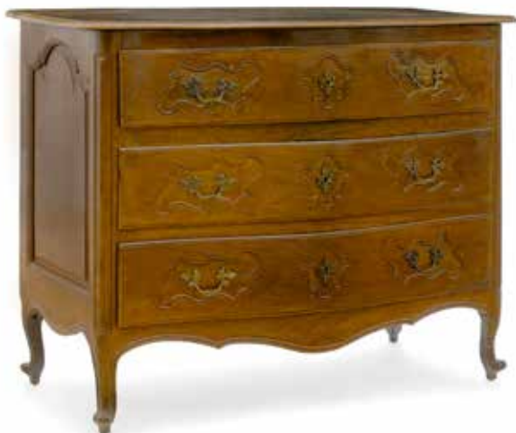
423 A LOUIS XV WALNUT SERPENTINE FRONT COMMODE W 18th century height 43in (109cm); width 53in (134cm); depth 24in (60cm) $2,000 - 3,000