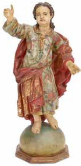
599 AN ITALIAN BAROQUE STYLE PAINTED GESSO AND CARVED WOOD FIGURE W 19th century height 37 3/4 in (96.5cm) $3,000 - 5,000