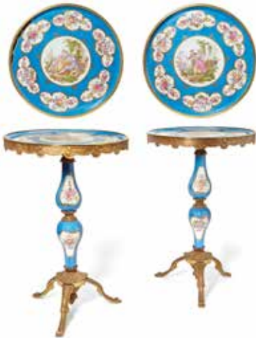
PROPERTY FROM THE ESTATE OF SAM M. COHODAS 396 A PAIR OF CONTINENTAL GILT BRONZE MOUNTED W PORCELAIN GUÉRIDONS height 23in (58.5cm); diameter of top 14 3/4in (37.5cm) $800 - 1,200