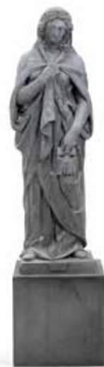
PROPERTY FROM AN OREGON ESTATE 306 A CAST ZINC FIGURE OF AN ACTRESS ON STAND W By Joseph Winn Fiske, 19th century With cast signature J. W. Fiske, 2628 Park Place, New York. height of figure 63in (160cm); height of stand 22in (55cm) $4,000 - 6,000