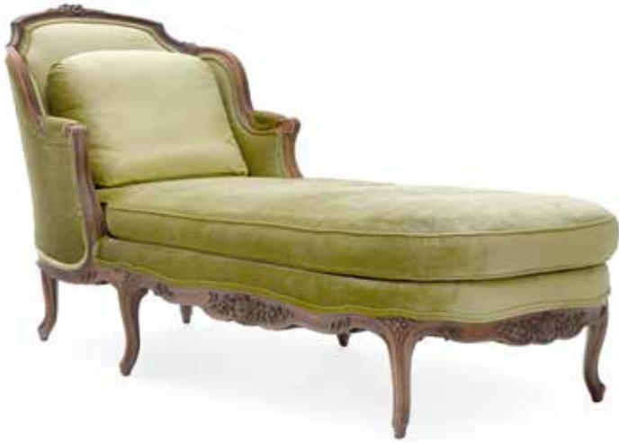
416 A LOUIS XV STYLE WALNUT CHAISE LONGUE

W Late 18th/early 19th century height 34 1/2in (87cm); width 44in (111cm); depth 21 1/2in (54cm) $2,000 - 3,000