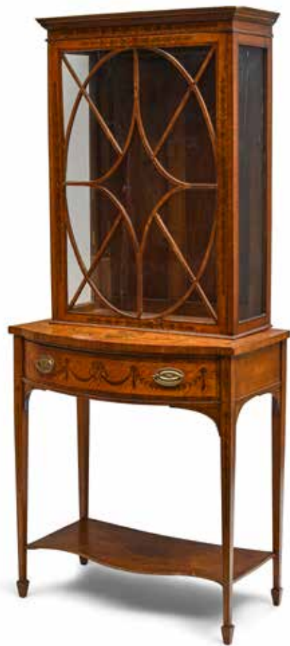
626 AN EDWARDIAN INLAID SATINWOOD VITRINE ON STAND W Early 20th century height 76in (193cm); width 32 1/2in (82cm); depth 20in (50cm) $2,000 - 3,000