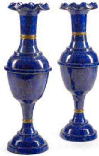
673 A PAIR OF LAPIS VASES W height 29 1/2in (74cm) $2,000 - 3,000