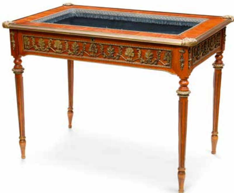
PROPERTY OF ANOTHER OWNER 628 A LOUIS XVI STYLE GILT BRONZE MOUNTED FRUITWOOD VITRINE TABLE W height 31in (78cm); width 43in (109cm); depth 26 1/4in (66cm) $2,500 - 3,500