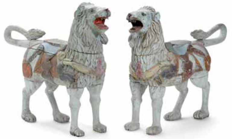
303 A PAIR OF PAINTED AND CARVED WOOD CAROUSEL LIONS W Possibly Italian, 19th century height of taller 29in (73cm); width 43in (109cm) $3,000 - 5,000