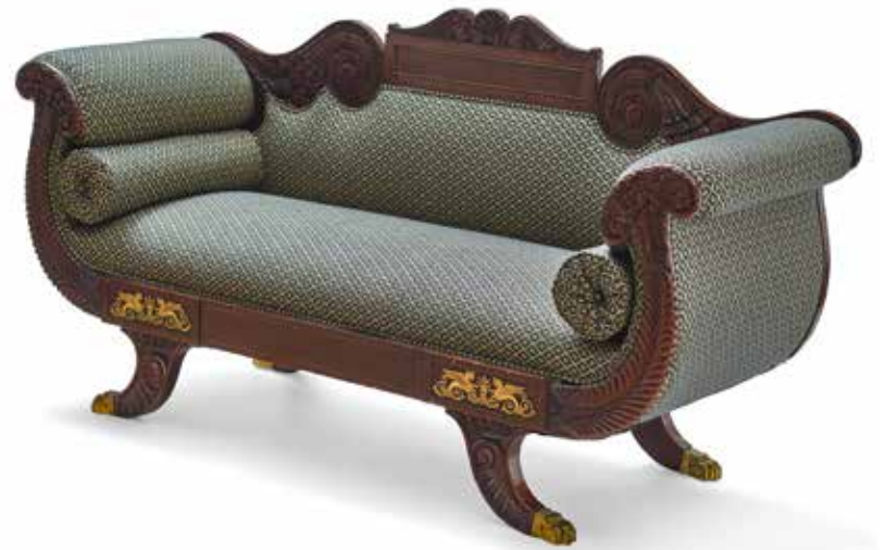
456 A CLASSICAL MAHOGANY SOFA W 19th century height 35in (88cm); width 69in (175cm); depth 24in (60cm) $2,500 - 3,500