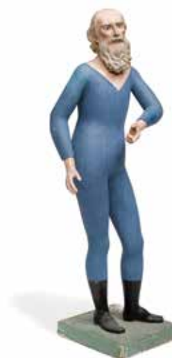
PROPERTY FROM AN OREGON ESTATE 301 A NEAPOLITAN PAINTED AND CARVED WOOD BEARDED CRÈCHE FIGURE 19th century height 61 1/2in (156cm) $1,500 - 2,500