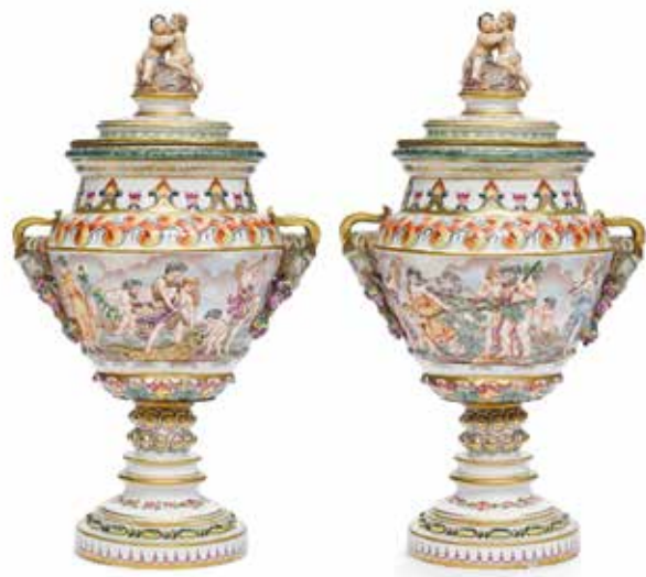
705 A PAIR OF CAPODIMONTE PORCELAIN COVERED VASES W Late 19th/early 20th century Overglaze blue crowned N. height 24in (61cm) $2,500 - 3,500