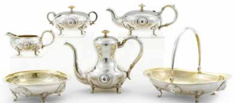
70 PROPERTY OF VARIOUS OWNERS A RUSSIAN 84 STANDARD SILVER SIX-PIECE TEA AND COFFEE SERVICE by Karl Jasivelainen, assay master mark B.C, St. Petersburg, 1869 Comprising: a teapot, a coffee pot, a covered sugar bowl, a cream jug, a footed bowl and a cake basket, total weight approximately 90oz troy height of coffee pot 7 3/4in (19.5cm); length of cake basket 10 1/2in (26.5cm). $8,000 - 12,000