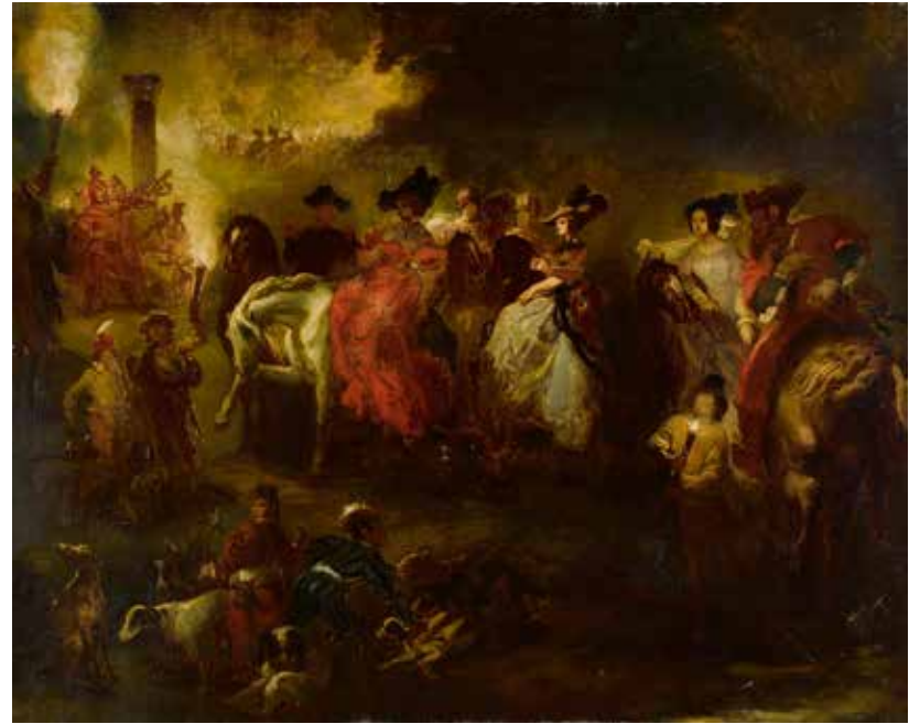
542 FRENCH SCHOOL, 19TH CENTURY W Le depart de la chasse (esquisse) oil on canvas 51 1/4 x 63 7/8in (130.2 x 162.2cm) $3,000 - 5,000 For Provenance please refer to the online catalogue.