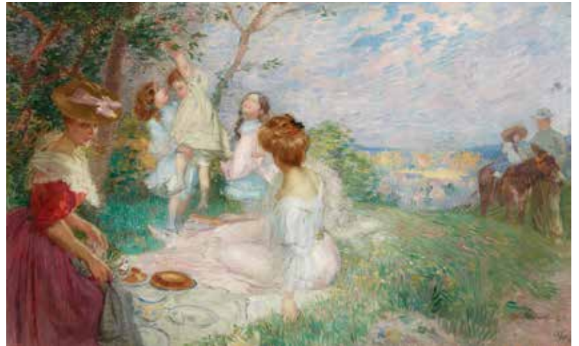
PROPERTY FROM A PRIVATE COLLECTION, KANSAS CITY, MISSOURI 435 AUGUSTE FREDERIC BONNET (FRENCH, 19TH/20TH CENTURY) Le pique-nique signed and dated 'A F Bonnet 06' (lower right) oil on canvas 22 x 35 1/2in (55.9 x 90.2cm) $3,000 - 5,000 For Provenance please refer to the online catalogue.