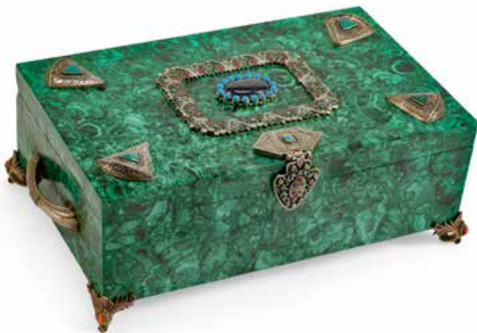
407 AN ENAMEL, HARDSTONE, AND SILVER MOUNTED MALACHITE BOX height 6 1/2in (16cm); width 16 1/4in (41cm); depth 11in (27cm) $2,500 - 3,500