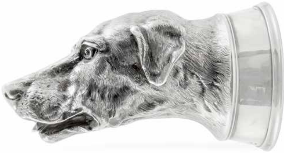
45 A VICTORIAN STERLING SILVER STIRRUP CUP, FINELY CAST AS A HOUND by Robert Hennell, London, 1874 Realistically modeled, gilded interior, flaring circular rim, length 6 1/2in (17cm), approximately 11oz troy. $8,000 - 12,000