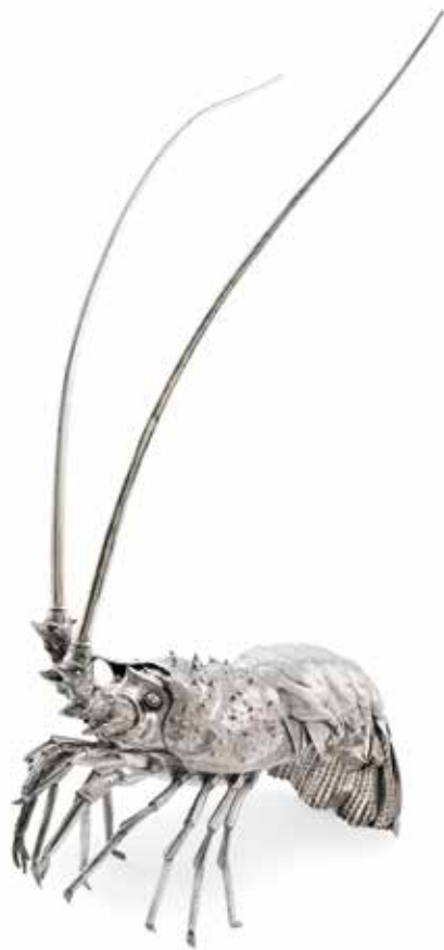
118 AN ITALIAN STERLING SILVER FIGURAL LOBSTER by Fratelli Lisi, Florence, 20th Century With two detachable antennas, length 12 1/2in (32cm), total silver weight approximately 31oz troy. $4,000 - 6,000