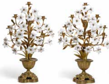
PROPERTY FROM AN OREGON ESTATE 400 TWO PAIRS OF GLASS AND GILT METAL FLORIFORM CANDELABRA W 19th century heights 24 1/2in (62cm) and 29 1/2in (75cm) $1,000 - 1,500