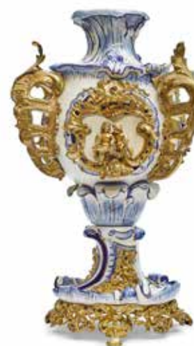
430 A LOUIS XV STYLE GILT BRONZE MOUNTED MAJOLICA URN W height 24 1/2in (61.5cm) $1,000 - 1,500