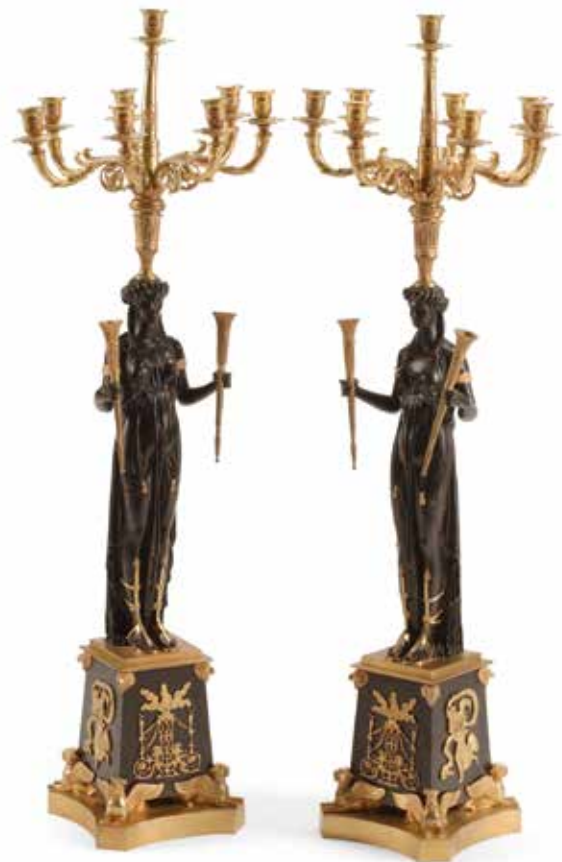
PROPERTY OF ANOTHER OWNER 607 A PAIR OF EMPIRE STYLE GILT AND PATINATED BRONZE SEVEN LIGHT FIGURAL CANDELABRA W height 44 1/2in (113cm); width 19in (48cm); depth 15in (38cm) $4,000 - 6,000