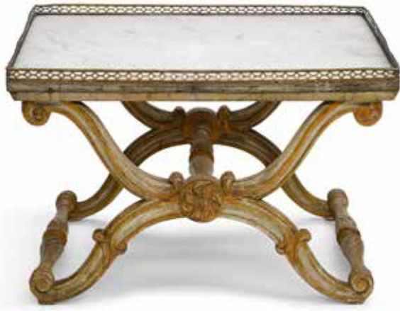
311 A CONTINENTAL NEOCLASSICAL MARBLE TOP PAINTED WOOD SIDE TABLE W Probably Italian, late 18th/early 19th century height 15 1/4in (38cm); width 23in (58cm); depth 19 1/2in (49cm) $2,000 - 3,000