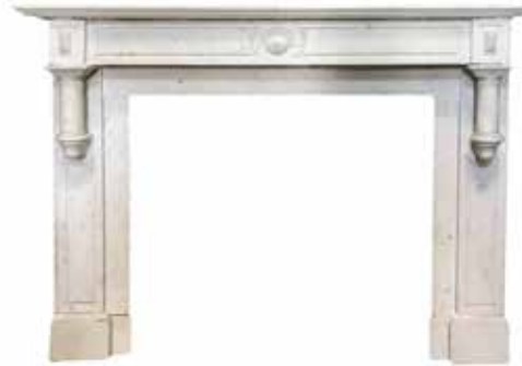
PROPERTY OF ANOTHER OWNER 397 NEOCLASSICAL STYLE MARBLE FIREPLACE W SURROUND Late 19th century Said to be from an Vanderbilt estate. $2,000 - 3,000