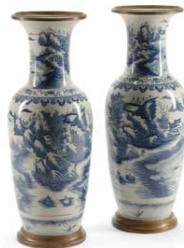
579 A PAIR OF BRONZE MOUNTED CHINESE BLUE AND WHITE PORCELAIN TALL VASES W height 40 1/2in (102cm) $3,000 - 5,000