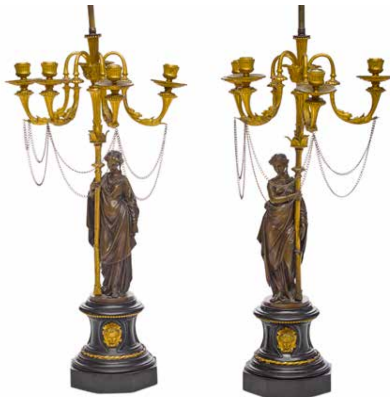
613 A PAIR OF EMPIRE STYLE PATINATED BRONZE FIGURAL CANDELABRA W Late 19th century Attributed to E.F. Caldwell, New York, model A013157 height 41in (104cm) $4,000 - 6,000