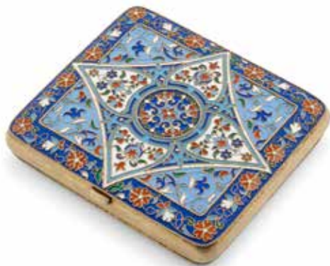
67 A RUSSIAN GILT SILVER AND ENAMEL CIGARETTE CASE by Khlebnikov, Moscow, 1893 Length 3 1/2in (9cm); width 3in (7.5cm). $2,000 - 3,000