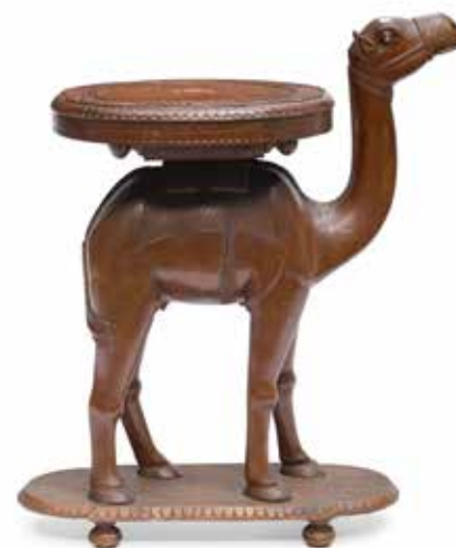
298 A CARVED HARDWOOD CAMEL FORM PEDESTAL 20th century height 34in (86cm); width 27in (68cm); depth 17 1/2in (44cm) $2,000 - 3,000