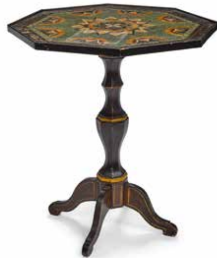
487 AN ITALIAN FAUX PIETRA DURA TOP PAINTED WOOD TABLE W 19th century height 31 1/2in (80cm); diameter 29in (73cm) $2,000 - 3,000