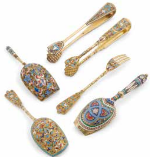
68 THREE RUSSIAN SILVER AND ENAMEL TEA SERVING PIECES by Paula Mishukova, Moscow, 1890 Together with gilt silver and enamel sugar tongs by Vassily Agafonov Moscow, circa 1901, and two Russian gilt silver and enamel sugar scoops, the largest tongs length 5 1/2in (14cm). $2,500 - 3,500