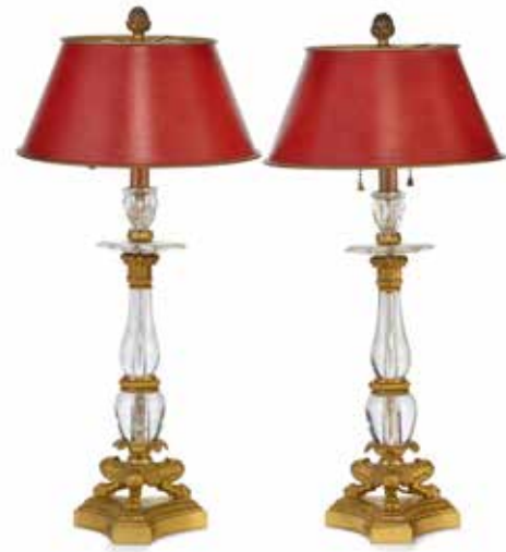
PROPERTY OF A PRIVATE SAN FRANCISCO BAY AREA COLLECTOR 710 A PAIR OF EMPIRE STYLE GILT BRONZE MOUNTED ROCK CRYSTAL LAMPS W Possibly E. F. Caldwell, New York, mid 20th century height of candlesticks 15 3/4in (40cm); height overall 24 1/2in (62cm) $3,000 - 5,000