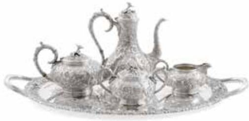
10 AN AMERICAN STERLING SILVER FOLIATE REPOUSSE-DECORATED FOUR-PIECE TEA AND COFFEE SERVICE WITH MATCHING TWO HANDLED TRAY W by S. Kirk & Son Co., Baltimore, MD, circa 1896-1925 The tray length over handles 27in (68cm), total silver weight approximately 169oz troy. $2,500 - 4,000