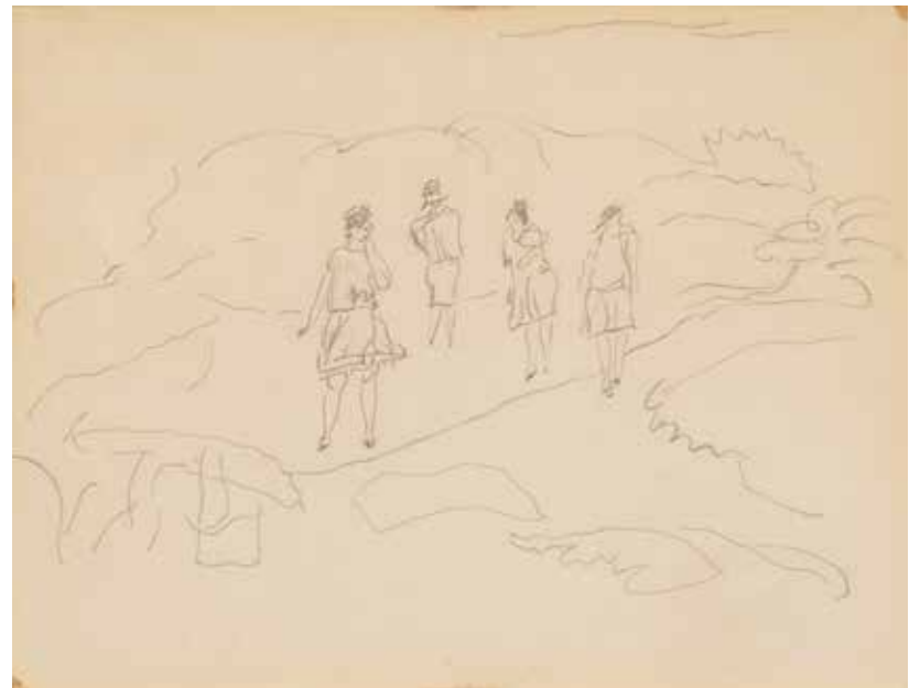
PROPERTY OF ANOTHER OWNER 758 JULES PASCIN (FRENCH, 1885-1930) Au bar; Sans titre (a group of two) Au bar inscribed and dated 'Au bar 1922' (lower right), inscribed 'au bar - dessin par Pascin 1922' (on the reverse); Sans titre unsigned. both graphite on paper Au bar 8 1/4 x 11in (21.0 x 27.9cm); Sans titre 7 3/4 x 10 1/4in (19.7 x 26.0cm) Au bar Executed in 1922 $4,000 - 6,000