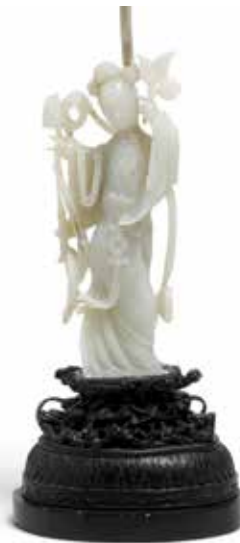
714 A CHINESE CARVED HARDSTONE BEAUTY W MOUNTED AS LAMP 20th century On ebonized carved wood base, with hardstone finial. height overall 33 1/2in (85cm) $2,000 - 3,000