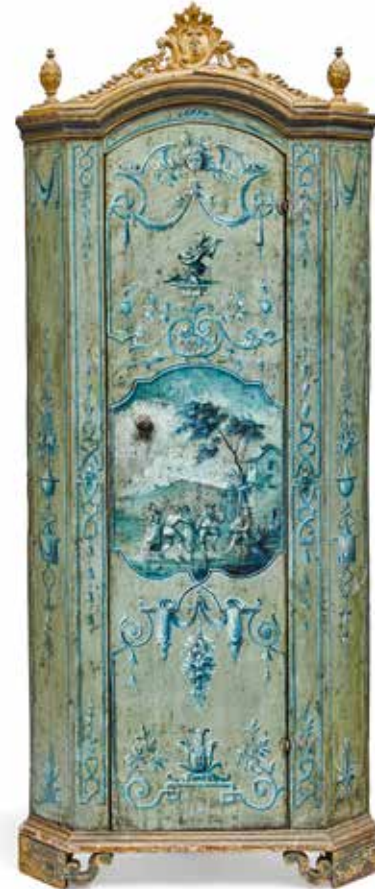
703 A CONTINENTAL ROCOCO STYLE PAINTED AND DECORATED WOOD CORNER W CABINET 19th Century, with 18th century elements height 89in (226cm); width 37in (93cm); depth 21in (53cm) $2,000 - 3,000