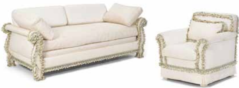
587 A SYRIE MAUGHAM UPHOLSTERED DAYBED AND AN ARMCHAIR W 1930s daybed height 27 1/2in (69cm); length 89 1/2in (227cm); width 36in (91cm); armchair height 32in (81cm); width 30 1/2in (77cm); depth 30 1/2in (77cm) $2,500 - 3,500