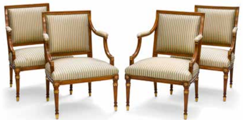
625 A SET OF FOUR CONTINENTAL NEOCLASSICAL PARCEL GILT FRUITWOOD W ARMCHAIRS Late 18th century height 35in (88cm); width 24 1/2in (62cm); depth 23in (58cm) $4,000 - 6,000