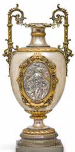
429 A SILVERED AND GILT METAL AND BRONZE TWO HANDLED URN W On marble base. height 23 1/4in (59cm) $1,000 - 1,500