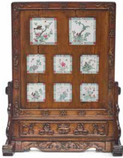
580 A CHINESE PORCELAIN MOUNTED CARVED HARDWOOD TABLE SCREEN W Late Qing/Republic period height overall 38 1/2in (97cm); width 30 1/2in (77cm); depth 10 3/4in (27cm) $2,500 - 3,500