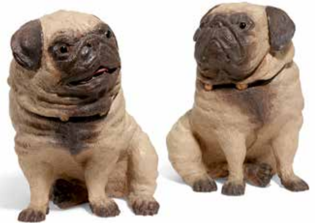
PROPERTY OF VARIOUS OWNERS 304 TWO AUSTRIAN GLAZED TERRACOTA FIGURES OF PUGS W Late 19th/early 20th century heights 14 1/2in and 15in (37.5cm and 38.5cm) $2,000 - 3,000