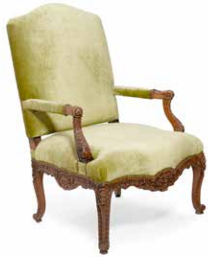
421 A LOUIS XV STYLE CARVED WALNUT FAUTEUIL W 20th century height 43in (109cm); width 27in (68 cm); depth 31in (78 cm) $1,000 - 1,500