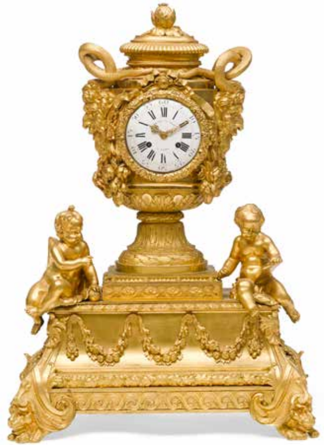
192 AN IMPOSING NAPOLEON III GILT BRONZE MANTEL CLOCK W Étienne Le Noir, Paris, second half 19th century The dial inscribed ETIENNE LE NOIR A PARIS. height 29 1/4in (74cm) $6,000 - 8,000