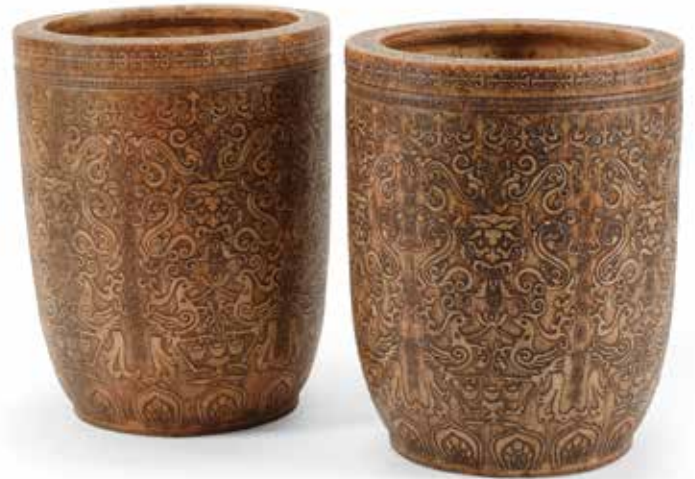
712 A PAIR OF CHINESE STYLE CARVED MARBLE JARDINIÈRES W height 23 1/2in (59cm); diameter 18 1/2in (46cm) $2,500 - 3,500