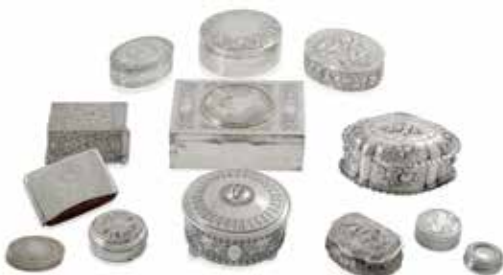
80 AN ASSEMBLED GROUP OF TWELVE INTERNATIONAL SILVER BOXES AND A CARD CASE by various makers, 19th-20th century the largest box length 7in (17cm). $800 - 1,200