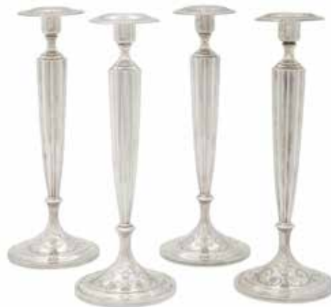
8 AN AMERICAN STERLING SILVER SET OF FOUR CANDLESTICKS by Shreve & Co., San Francisco, CA, 20th century Floral rim, circular base, weighted and marked base loaded, height 12in (30cm); diameter at base 4in (10cm). $800 - 1,200