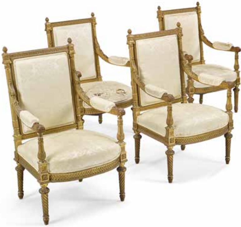
PROPERTY OF A PRIVATE SAN FRANCISCO BAY AREA COLLECTOR 622 A SET OF FOUR LOUIS XVI STYLE GILTWOOD FAUTEUILS A LA REINE W Fourth quarter 19th century height 40 3/4in (103.5cm); width 24 1/2in (62cm); depth of seat 20 1/2in (52cm) $2,500 - 3,500