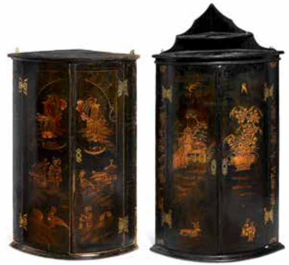
581 TWO GEORGE III CHINOISERIE DECORATED BLACK LACQUERED HANGING CORNER CABINETS W 18th century height of larger 44 1/2in (113cm); width 22in (55cm); depth 16in (40cm) $1,500 - 2,500