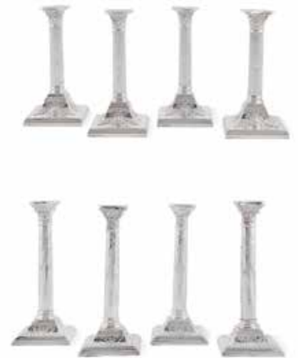
30 A SET OF FOUR GEORGE V SILVER CORINTHIAN COLUMN CANDLESTICKS by Hawksworth, Eyre & Co. Ltd., Sheffield, 1904 With weighted bases; together with four English silver-plated column form candlesticks, the tallest candlestick height 12in (30cm). $1,000 - 2,000