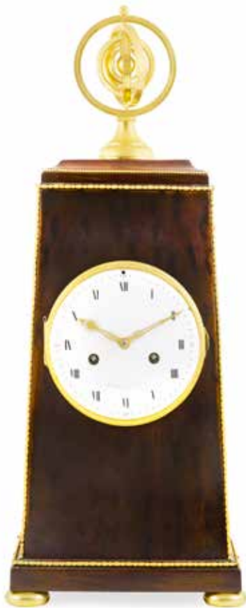
193 A FRENCH GILT BRONZE MOUNTED MAHOGANY MANTEL CLOCK W 19th century The dial signed Guinets a Paris. height 22in (55cm); width 9 1/4in (23cm); depth 6 1/2in (16cm) $4,000 - 6,000