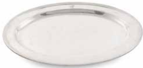
PROPERTY OF VARIOUS OWNERS 13 AN AMERICAN STERLING SILVER OVAL SERVING TRAY by Tiffany & Co., New York, NY, circa 1923-1947 Double-banded rim, length 18in (46cm), total silver weight approximately 63oz troy. $2,000 - 3,000