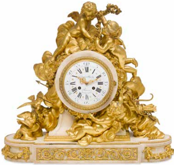
191 A FRENCH GILT BRONZE AND MARBLE FIGURAL MANTEL CLOCK W Graux Marly, Paris, second half 19th century The dial inscribed Graux Marly A Paris Rue du Parc-Royal, 8. height 23 1/2in (59.5cm) $12,000 - 18,000