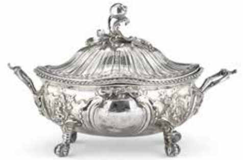
PROPERTY OF A PRIVATE SAN FRANCISCO BAY AREA COLLECTOR 36 A GEORGE II STERLING SILVER LIDDED TUREEN by William Holmes and Nicholas Dumée, London, 1759 Body with engraved armorial, lid with figural blossom finial, width across handles is 17in (43cm) , silver weight approximately 97.44oz troy. $2,000 - 3,000