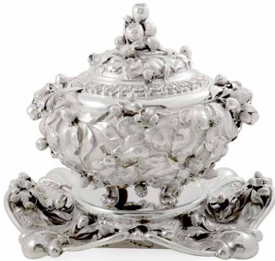
114 AN ITALIAN 800 STANDARD SILVER SOUP TUREEN ON STAND WITH MATCHING LADLE, by Mario Buccellati, Milan, marked 15-MI, 1934-1944 The circular tureen on four scroll feet, with two-handled insert and lid with decorative fruit finial, the stand with scroll rim and applied fruits and leaves, the ladle with figural fruit handle, the tureen height 12in (30cm), width 13 1/2in (35cm), total weighable silver approximately 213oz troy. $10,000 - 12,000