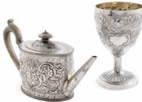
38 AN GEORGE III STERLING SILVER TEAPOT by George Smith, London, 1874 With floral repousse decoration, together with a George III chalice with chased floral and avian decoration, gilt interior, marked London 1807, rubbed makers mark, the chalice height 6 1/2 in (17cm); the teapot length 10 1/2in (27cm) , total weighable silver approximately 23oz troy. $2,000 - 3,000