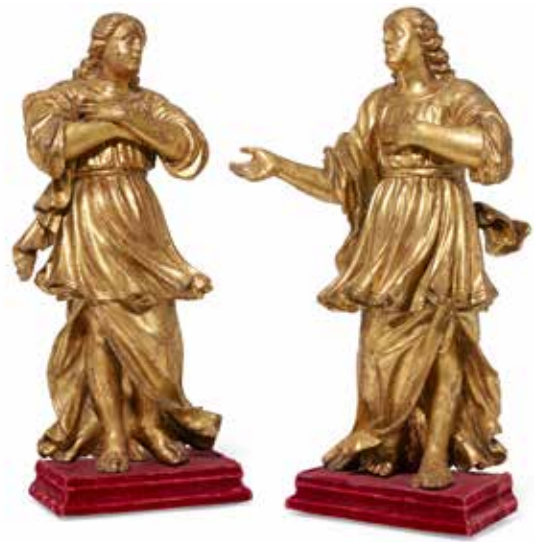
600 A PAIR OF ITALIAN CARVED AND GILTWOOD FIGURES W 19th century On later velvet bases. heights 18 1/2in (47cm) and 19in (48.5cm) $2,000 - 3,000