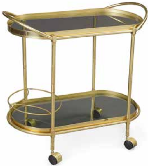
PROPERTY OF A PRIVATE SAN FRANCISCO BAY AREA COLLECTOR 381 A MID-CENTURY BRASS AND GLASS DRINKS CART W height 28 1/2in (72.5cm); width 30in (76cm); depth 17in (43cm) $1,000 - 1,500