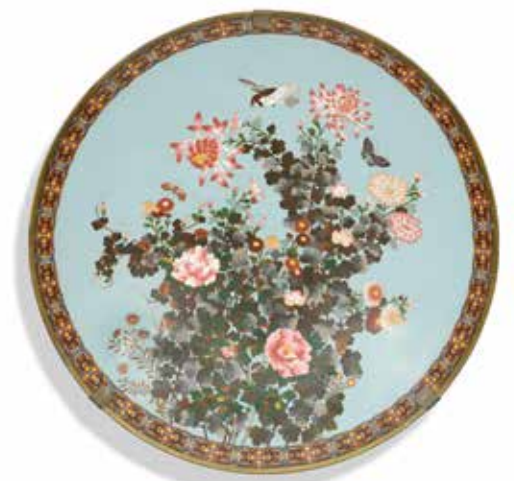
715 A JAPANESE CLOISONNÉ CHARGER W diameter 23 3/4in (62cm) $1,000 - 1,500