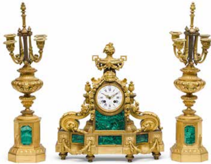
406 A LOUIS XVI STYLE GILT BRONZE AND MALACHITE THREE PIECE CLOCK GARNITURE W Raingo Freres, 19th century The enamel clock face inscribed RAINGO FRES , case stamped 5352. height 17in (43.2cm); height of candelabra 22 3/4in (58cm) $5,000 - 7,000