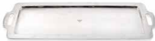
17 AMERICAN STERLING SILVER TWO-HANDLED TRAY W by Tiffany & Co., first half 20th century Central monogram. silver weight approximately 63oz troy; length 24 1/2in (62cm). $1,000 - 1,500