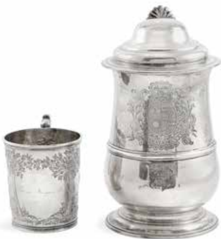
48 A GEORGE III SILVER TANKARD by William Grundy, London, 1767 With coat of arms to front, together with an English Coin Silver mug, Birmingham, 1855, repousse decoration possibly a scene from Tarrytown, NY, and inscribed George Morgan Pond, height of tankard 9in (23cm), total weight 41oz troy. $3,000 - 4,000