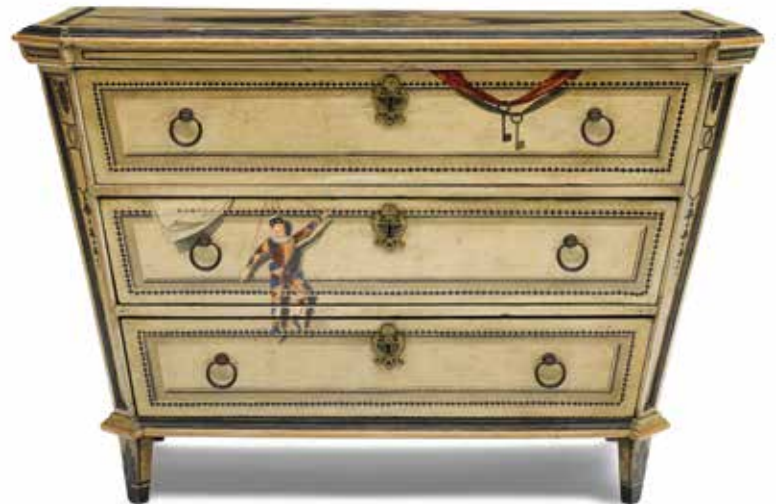
350 AN ITALIAN NEOCLASSICAL TROMP L'OEIL DECORATED AND PAINTED WOOD W COMMUNE Late 18th century height 38 3/4in (98cm); width 54 3/4in (139cm); 23 3/4in (60cm) $4,000 - 6,000