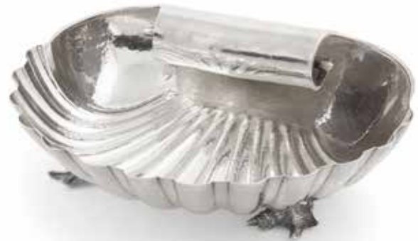
126 AN ITALIAN HAND-HAMMERED STERLING SILVER SHELL DISH marked Buccellati, 20th century On figural shell feet, length 9in (23cm), silver weight approximately 19oz troy. $1,500 - 2,000