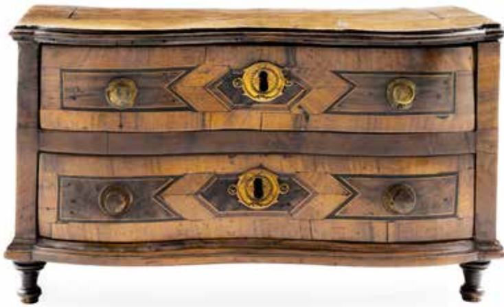
PROPERTY FROM AN OREGON ESTATE 601 A GERMAN BAROQUE INLAID WALNUT MINIATURE CHEST OF DRAWERS 18th century height 7 1/2in (19.4cm); width 13 1/4in (33.5cm); depth 6 1/2in (16.5cm) $700 - 900