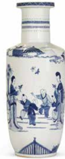
PROPERTY FROM THE TALLEY FAMILY ESTATE 576 A CHINESE BLUE AND WHITE PORCELAIN BALUSTER VASE 19th century height 18 1/4in (46.5cm) $1,000 - 1,500