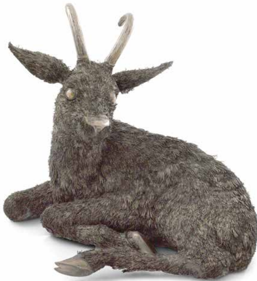
117 AN ITALIAN STERLING SILVER GOAT with the mark of Buccelatti, 20th Century length 14in (35.5cm); silver weight approximately 55oz troy. $7,000 - 9,000