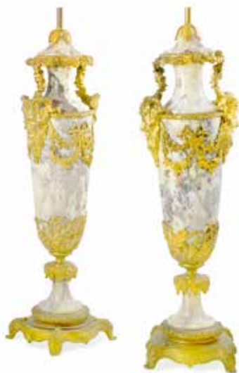
425 A PAIR OF NEOCLASSICAL STYLE GILT BRONZE MOUNTED MARBLE TABLE LAMPS W height of urn 24 3/4in (63cm); overall height 43in (109cm) $2,500 - 3,500