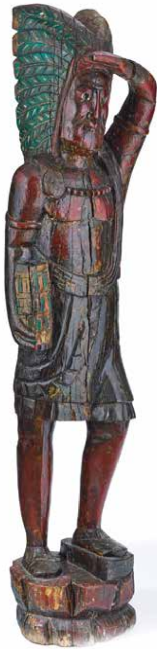
302 AN AMERICAN CARVED AND PAINTED CIGAR STORE NATIVE AMERICAN W 20th century height 71in (180cm) $2,000 - 3,000