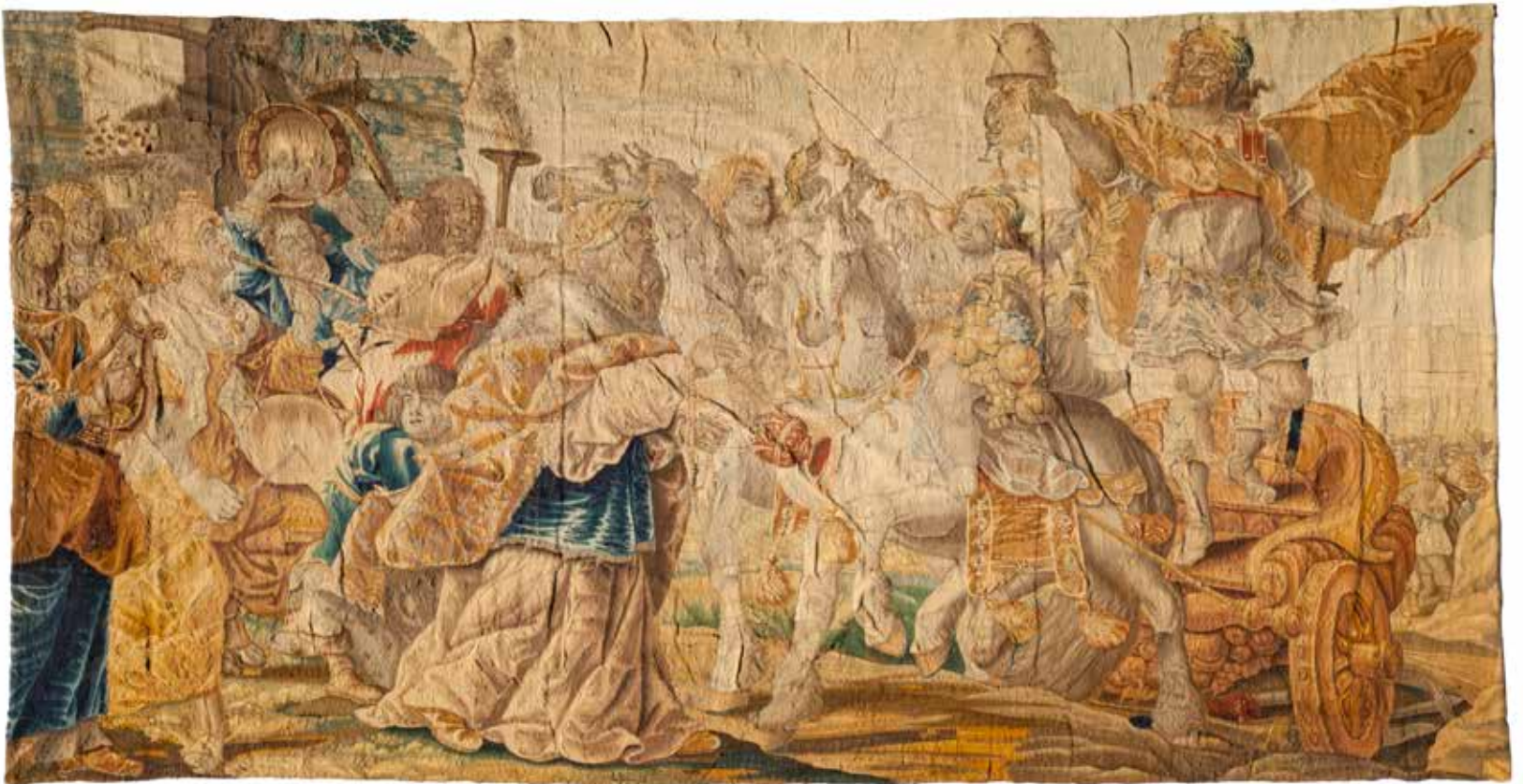
246 A FLEMISH WOOL HISTORICAL TAPESTRY: L'HISTOIRE D'ANNIBAL W 17th century dimensions 13ft 5in x 8ft 8in (408cm x 264cm) $10,000 - 12,000