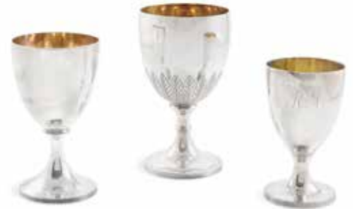
39 THREE GEORGE III SILVER GOBLETs by various makers, circa 1800 The tallest with the mark of Alex Graham & Co, Edinburgh, 1801; the middle goblet with the mark of John Emes, London, 1797; the smallest goblet with the mark of James Mince, London 1792, the tallest height 7 1/2in (19cm) , total silver weight approximately 27oz troy. $2,500 - 3,500