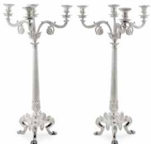
PROPERTY OF VARIOUS OWNERS 612 A PAIR OF ENGLISH SILVER PLATED FOUR LIGHT CANDELABRA W 19th century Impressed 693. height 26 1/4in (67cm) $2,000 - 3,000