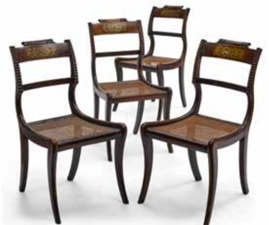
PROPERTY OF VARIOUS OWNERS 292 A SET OF FOUR REGENCY BRASS INLAID MAHOGANY DINING CHAIRS W 19th century height 33 1/2in (85cm); width 18in (45cm); depth 17in (43cm) $800 - 1,200