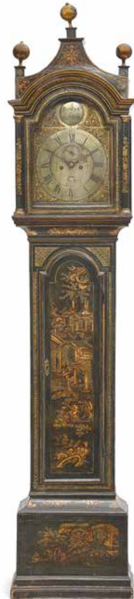
PROPERTY FROM AN OREGON ESTATE 584 A GEORGE III CHINOISERIE DECORATED AND GREEN JAPANNED TALL CASE CLOCK W 18th century The dial inscribed Bowly, London. height 92in (233cm) $2,000 - 3,000