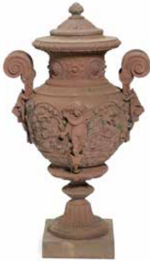
562 A NEOCLASSICAL STYLE CAST IRON COVERED URN W height 35in (88cm); width 20in (50cm) $2,000 - 3,000