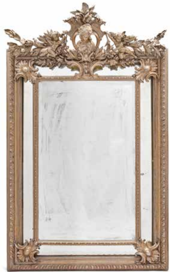
PROPERTY FROM A PRIVATE COLLECTION 726 A LOUIS XVI STYLE PAINTED COMPOSITION AND WOOD MIRROR W Late 19th century height 85in (215cm); width 53in (134cm) $2,500 - 3,500