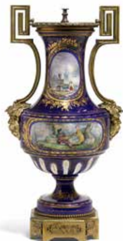
PROPERTY FROM AN OREGON ESTATE 427 A SÈVRES STYLE GILT BRONZE MOUNTED PORCELAIN URN MOUNTED AS A LAMP W Late 19th century height 22 5/8in (58cm) $800 - 1,200