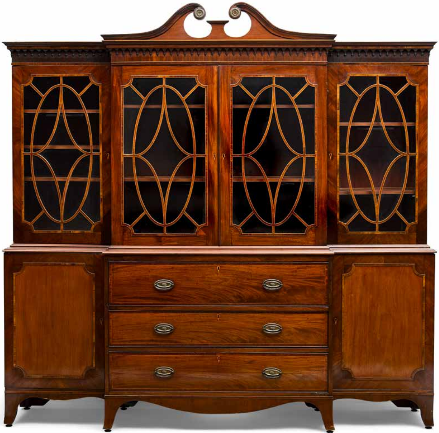
133 A GEORGE III MAHOGANY BREAKFRONT BOOKCASE W Circa 1790 height 86in (218cm); width 92in (233cm); depth 22in (55cm) $6,000 - 8,000