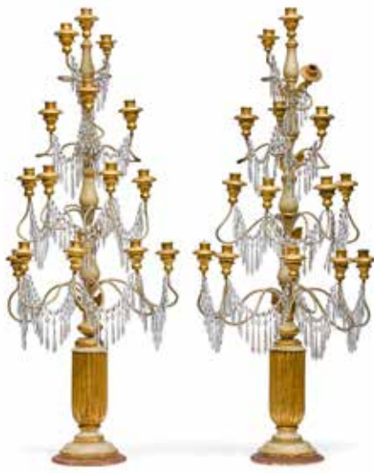
704 A PAIR OF LARGE CREAM PAINTED AND GILTWOOD, PAINTED METAL AND CUT GLASS FOURTEEN LIGHT CANDELABRA W 19th century height 60 1/4in (153cm) $1,500 - 2,000