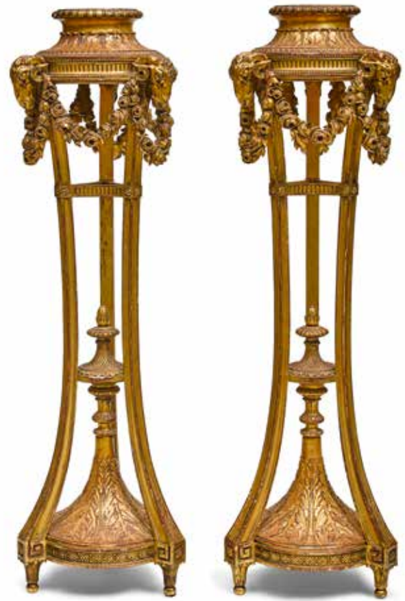
PROPERTY OF VARIOUS OWNERS 623 PAIR OF NEOCLASSICAL STYLE GILTWOOD TORCHERES W height 58in (147cm); diameter 18in (45cm) $3,000 - 5,000