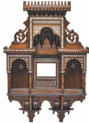
592 A LEVANTINE BONE AND EBONY INLAID HARDWOOD HANGING SHELF W 20th century height 51in (129cm); width 31 1/2in (80cm); depth 12 1/2in (31cm) $2,500 - 3,500