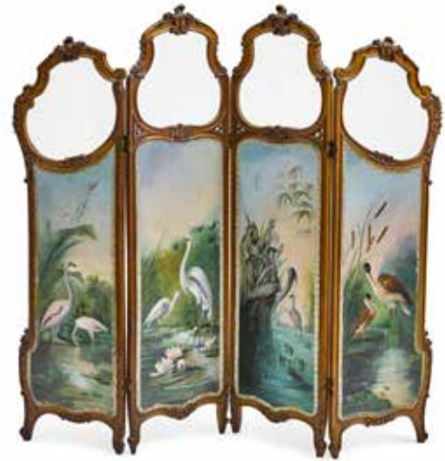
422 A LOUIS XV STYLE PAINTED CANVAS AND WALNUT FOUR PANEL SCREEN W height 64 3/4in (161cm); width of each panel 17in (43cm) $800 - 1,200