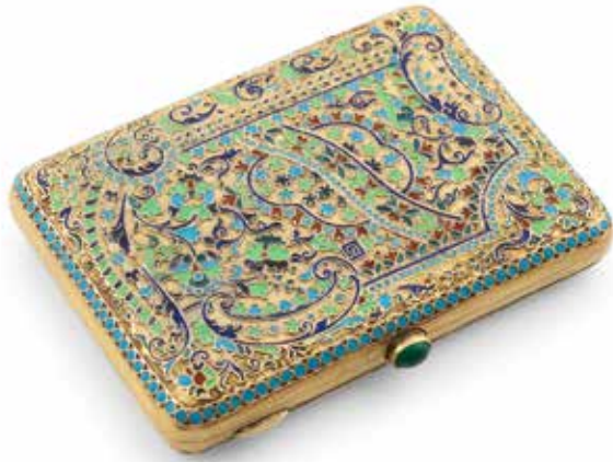
65 A RUSSIAN GILT SILVER AND ENAMEL CIGARETTE CASE late 19th-early 20th century With green jeweled clasp, length 5in (12.5cm). $1,500 - 2,000