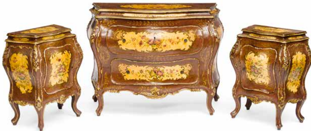
PROPERTY FROM AN OREGON ESTATE 346 A SUITE OF VENETIAN PAINTED WOOD FURNITURE W Comprising a commode, pair of petit side commodes and a mirror. height of commode 37in (93cm); width 50in (127cm); depth 21in (53cm) partial lot illustrated $5,000 - 7,000