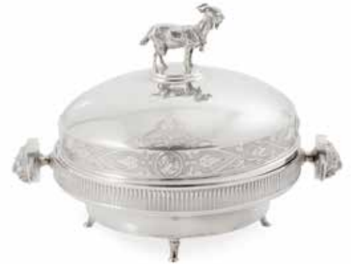
PROPERTY FROM AN OREGON ESTATE 15 AN AMERICAN SILVER LIDDED FIGURAL BUTTER DISH by Gorham Mfg. Co., Providence, RI, 19th century Lid with goat finial, the handles with applied lion head, length over handles 8 1/2in (22cm), total silver weight approximately 26oz troy. $1,200 - 1,800