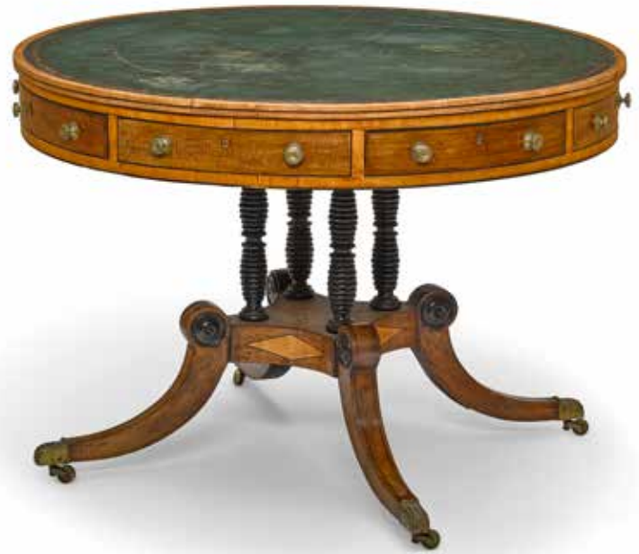
514 A REGENCY PART EBONIZED INLAID MAHOGANY LIBRARY TABLE W 19th century height 30in (76cm); diameter 38 1/2in (97cm) $3,000 - 5,000