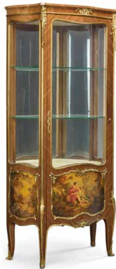
PROPERTY OF A PRIVATE SAN FRANCISCO BAY AREA COLLECTOR 629 A LOUIS XV STYLE GILT BRONZE MOUNTED PAINT DECORATED PARQUETRY VITRINE CABINET W Late 19th century Lacking marble top. height 62in (157.5cm); width 28 1/4in (71.5cm); depth 14in (35.5cm) $2,500 - 3,500