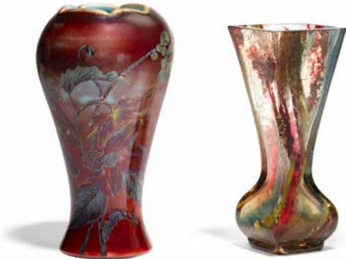
376 A VALLERYSTHAL ENAMELED CAMEO GLASS VASE AND A FRANCOIS-EUGENE ROUSSEAU AND ERNEST-BAPTISTE LEVEILLÉ GLASS VASE Circa 1905 and 1890 heights 8 5/8in (21.8cm) and 9 3/4in (24.8cm) $1,500 - 2,000