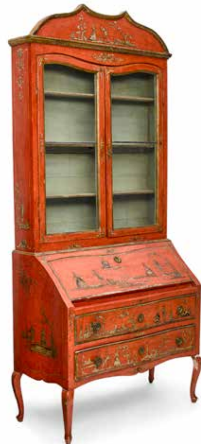
351 AN ITALIAN ROCOCO STYLE PAINT DECORATED WOOD BUREAU BOOKCASE W 19th century height 81in (205cm); width 42 1/2in (107cm); depth 18in (45cm) $4,000 - 6,000