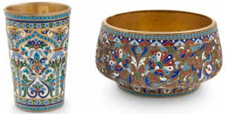
66 A RUSSIAN GILT SILVER AND ENAMEL CUPS by M.S. Sokolov, Moscow, late 19th-early 20th century Together with a Russian enamel and gilt silver sugar bowl, the sugar bowl diameter 4 1/2in (11.5cm). $1,500 - 2,000