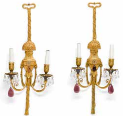
496 A PAIR OF GILT BRONZE TWO LIGHT WALL SCONCES W SCONCES Attributed to E.F. Caldwell & Co, New York City, late 19th century height 26 1/4in (67cm) $1,500 - 2,000