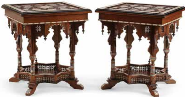
PROPERTY OF ANOTHER OWNER 593 A PAIR OF LEVANTINE PART EBONIZED BONE INLAID TABLES W 20th century height 27 1/2in (69cm); width 27 1/2in (59cm); depth 23 1/2in (59cm) $3,000 - 5,000