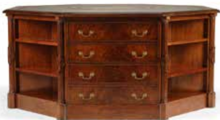
290 A GEORGE III STYLE MAHOGANY OCTAGONAL RENT CABINET W 20th century height 36in (91cm); width 78in (198cm); depth 78in (198cm) $6,000 - 8,000