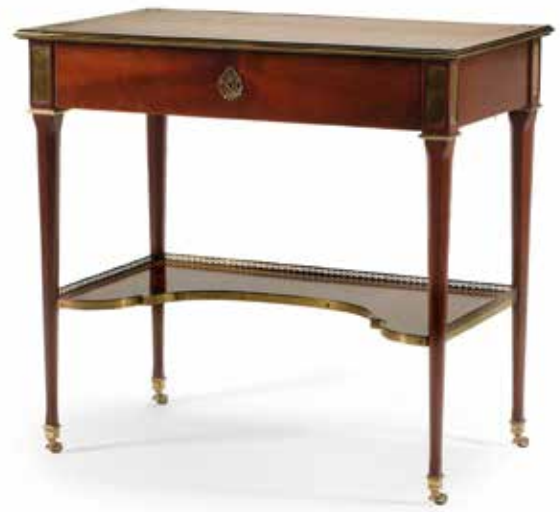
410 A BALTIC STYLE GILT BRONZE MOUNTED MAHOGANY WRITING TABLE W 19th century height 30in (76cm); width 32in (81cm); depth 18 3/4in (47cm) $2,000 - 3,000