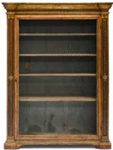
486 AN ITALIAN NEOCLASSICAL STYLE PARCEL GILT AND PAINTED WOOD WIRE DOOR BIBLIOTHEQUE W 19th century height 69 1/4in (175cm); width 52 3/4in (133cm); depth 15 3/4in (40cm) $2,500 - 3,500