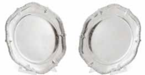
42 A PAIR OF GEORGE II SILVER SECOND COURSE DISHES by Nicholas Sprimont, London, 1743 Engraved circa 1770 with a coat-of-arms, each marked on reverse and engraved with scratch weight and number, No. 2 25=17, No. 3 25=15, diameter 11 1/2in (29cm) ; approximately 49oz troy. $3,000 - 5,000