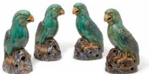
297 FOUR CHINESE GREEN GLAZED EARTHENWARE PARROTS 20th century height 13 1/2in (34.2cm) $1,500 - 2,000