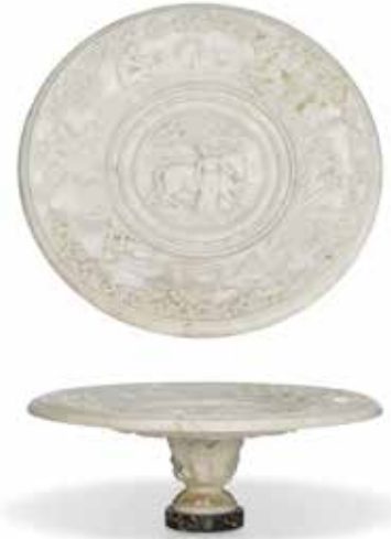
675 A NEOCLASSICAL STYLE CARVED MARBLE FOOTED CENTERPIECE height 7in (18cm); diameter 9 3/4in (50cm) $1,000 - 1,500