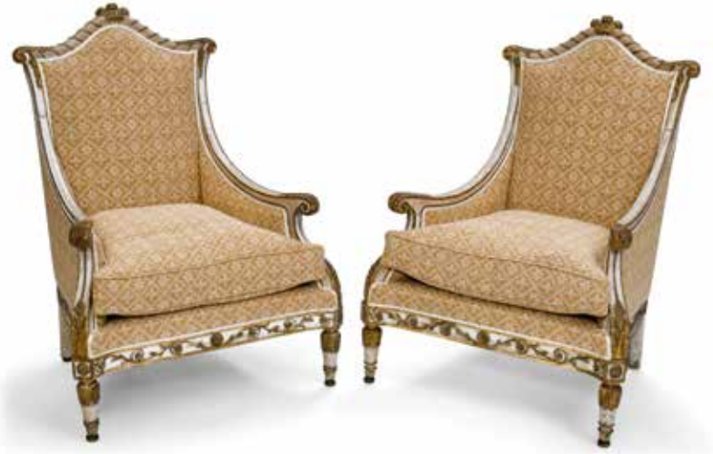
314 A PAIR OF CONTINENTAL PARCEL GILT AND PAINTED WOOD BERGERES W Early 19th century height of taller 42in (106cm); width 32in (81cm); depth 30in (76cm) $2,000 - 3,000