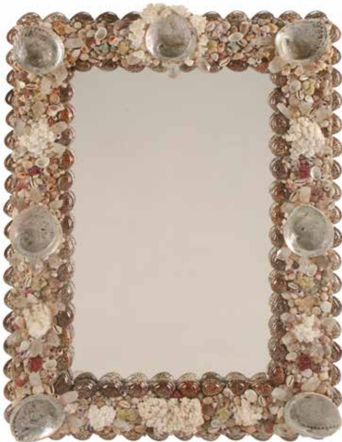
702 A SHELLWORK AND ROCK CRYSTAL MIRROR W height 58 1/2in (148cm); width 38 1/2in (97cm) $4,000 - 6,000