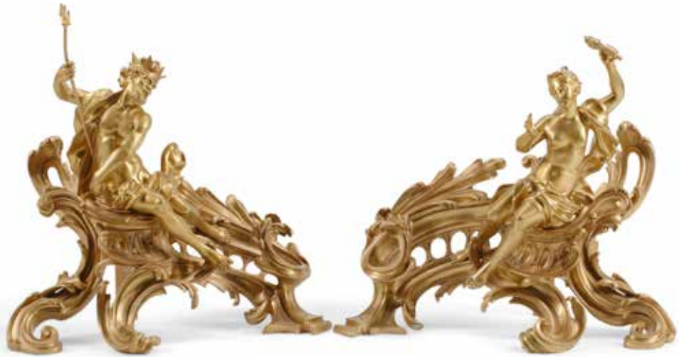
618 A PAIR OF LOUIS XV STYLE GILT BRONZE CHENETS height 20in (50cm); width 20in (50cm); depth 10in (25cm) $3,000 - 5,000