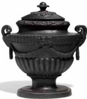
PROPERTY FROM AN OREGON ESTATE 619 A NEOCLASSICAL STYLE CAST IRON COVERED URN height 17in (43.2cm); width 15 1/2in (39.4cm) $800 - 1,200