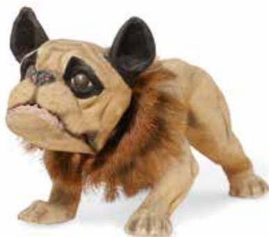
294 A FRENCH FELTED PAPER MACHÉ AND STRAW GROWLER FRENCH BULLDOG PULL TOY Late 19th century height 12 1/4in (31.5cm); length 21 1/2in (54.5cm) $1,500 - 2,000