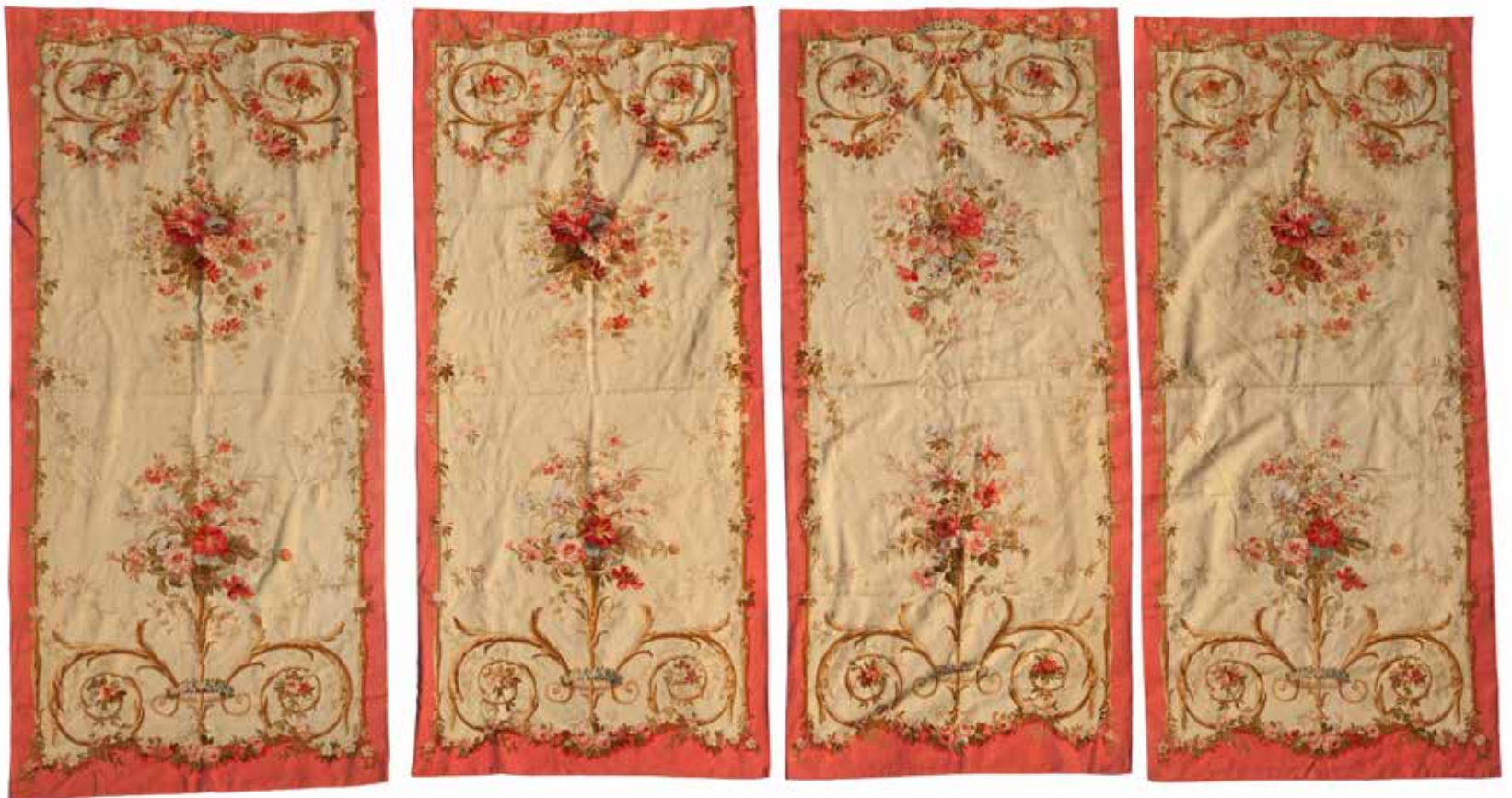
248 A SET OF FOUR AUBUSSON ENTRE FENÊTRES TAPESTRIES W Late 19th/early 20th century height of each panel 115 1/2 in (293cm); width 44in (111cm) $2,000 - 3,000