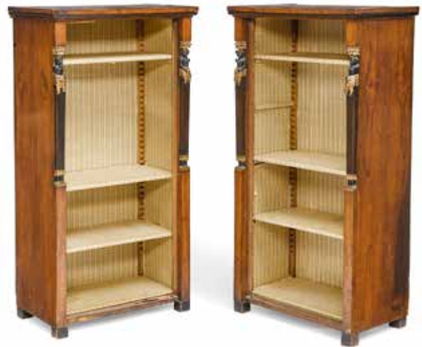
PROPERTY FROM AN OREGON ESTATE 659 A PAIR OF EMPIRE STYLE PARCEL GILT AND PART EBONIZED FRUITWOOD BOOKCASES W height 56 1/4in (142cm); width 29 1/4in (74cm); depth 18 (45cm) $2,000 - 3,000