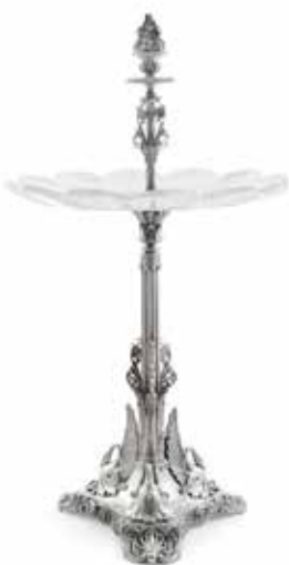
707 A NEOCLASSICAL STYLE SILVER PLATE AND CUT GLASS TAZZA W Bearing silver marks. height 29in (74cm); diameter 16 1/2in (42cm) $1,500 - 2,000