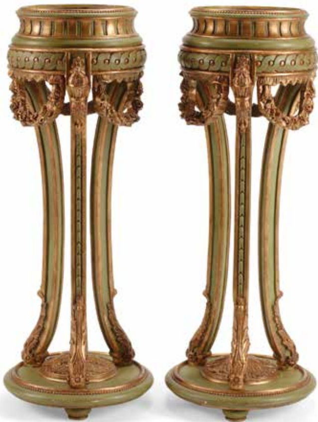
624 A PAIR ITALIAN NEOCLASSICAL STYLE PAINTED, PARCEL GILT AND CARVED W WOOD JARDINIÈRES With liners. height 47in (119cm); diameter 18in (45cm) $2,000 - 3,000