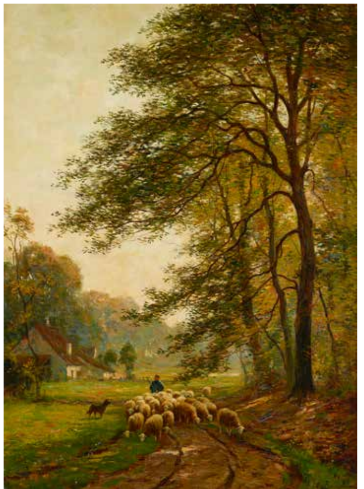
439 AUGUSTE BREUGELMANS (BELGIAN, 19TH/20TH CENTURY) W A landscape with a shepherd and his flock signed 'Aug Breugelmans' (lower right) oil on canvas 42 1/2 x 30 3/4in (108 x 78.1cm) $2,000 - 3,000