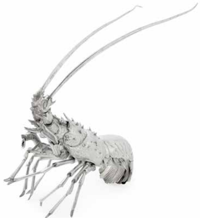
119 AN ITALIAN STERLING SILVER LARGE FIGURAL LOBSTER by Fratelli Lisi, Florence, 20th Century With two detachable antennas, the length 14in (35.5cm), total silver weight approximately 51oz troy. $5,000 - 7,000