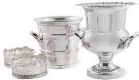
29 A PAIR OF VICTORIAN SILVERPLATE WINE BOTTLE COASTERS by Martin & Hall, Sheffield, second half 19th century Together with a Georgian silverplate wine cooler and an American two-handed silverplate wine cooler by Reed & Barton, Taunton, MA, the Georgian wine cooler height 11in (28cm), diameter 9in (23cm) (4 pieces). $1,000 - 1,500