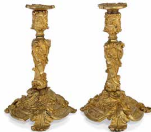
610 A PAIR OF LOUIS XV STYLE GILT BRONZE CANDLESTICKS Fourth quarter 19th century height 11in (30cm) $700 - 900