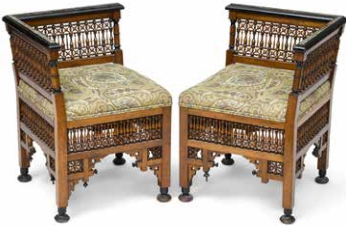
PROPERTY FROM AN OREGON ESTATE 591 A PAIR OF LEVANTINE PART EBONIZED BONE INLAID HARDWOOD CORNER CHAIRS W 20th century height 27in (68cm); width 19in (48cm); depth 19in (48cm) $2,000 - 3,000