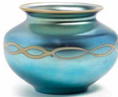
377 A STEUBEN DECORATED BLUE AURENE GLASS BOWL 1920s base etched Steuben Aurene 6178. height 5in (13cm); diameter 7in (18cm) $1,500 - 2,000