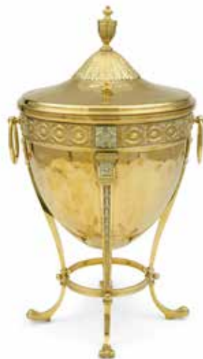
PROPERTY FROM AN IMPORTANT OREGON PRIVATE COLLECTION 620 A GEORGE III STYLE BRASS URN FORM COAL BOX Circa 1900 height 26in (66cm) $600 - 800