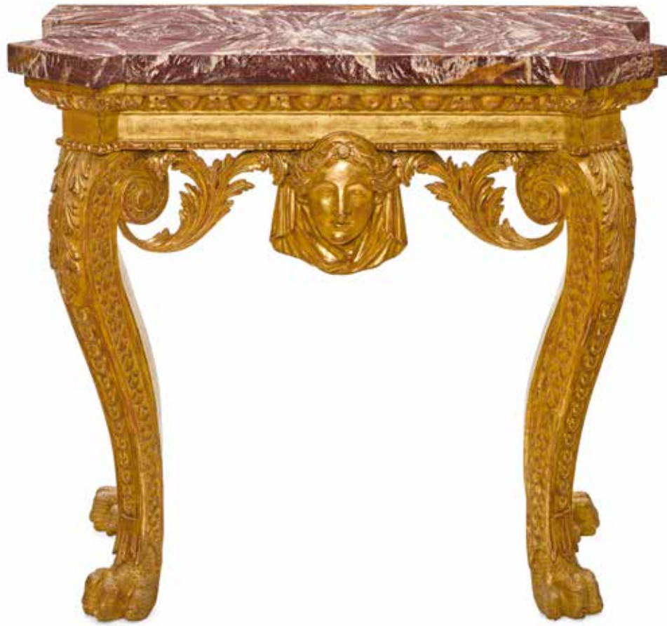
230 A GOOD GEORGE II CARVED GILTWOOD PIER TABLE W IN THE MANNER OF WILLIAM KENT SECOND QUARTER 18TH CENTURY Surmounted by a red onyx veneered top. height 35 3/4in (91cm); width 40 1/4in (102cm); depth 23in (58.5cm) $10,000 - 15,000