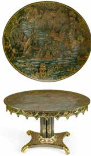
582 A WILLIAM V LATER CHINOISIERE DECORATED DRESSING TABLE W Early 19th century height 28 1/2in (72cm); width 46 1/2in (118cm); depth 30 1/2in (77cm) $3,000 - 5,000