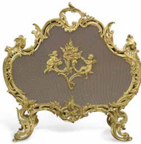
PROPERTY OF A PRIVATE SAN FRANCISCO BAY AREA COLLECTOR 615 A LOUIS XV STYLE GILT BRONZE FIRE SCREEN First quarter 20th century height 29in (73cm.5); width 29in (73.5cm) $500 - 800