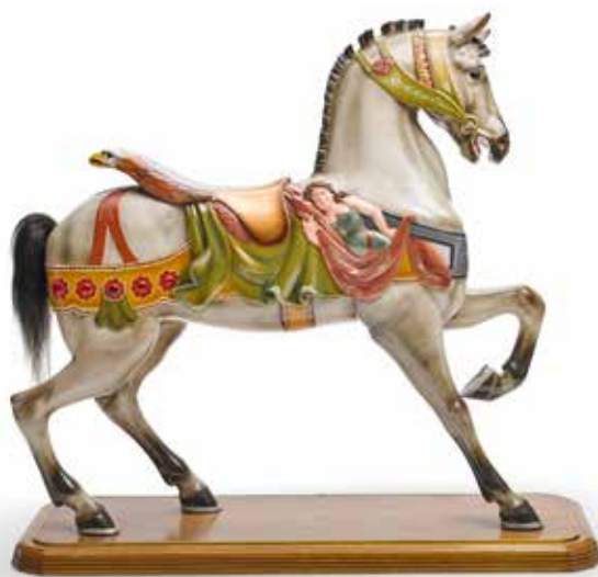
305 A CARVED AND PAINTED CAROUSEL HORSE W Attributed the Dentzel workshop, Philadelphia Early 20th century height 58in (147cm); length 59in (150cm)