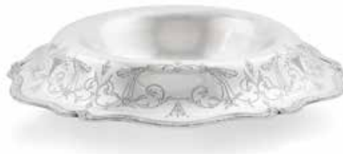
5 AN AMERICAN STERLING SILVER CENTERPIECE BOWL by Shreve & Co., San Francisco, CA 20th century Shaped circular with everted rim, height 3in (7.5cm); diameter 14in (35.5cm); total weighable silver approximately 35oz troy. $800 - 1,200