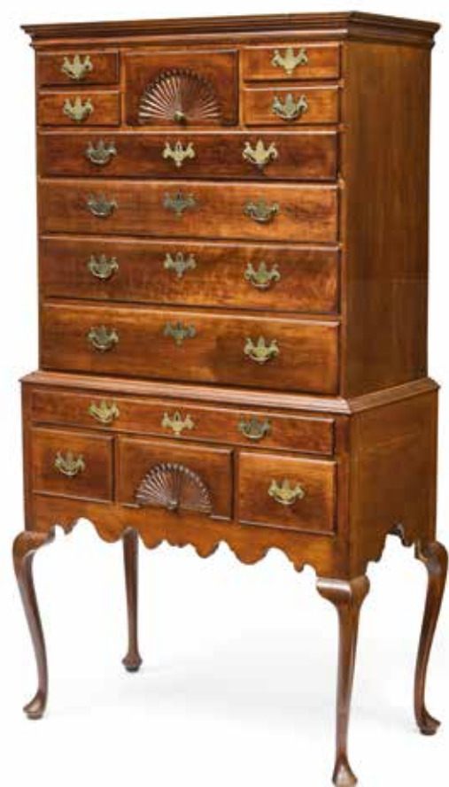
458 A QUEEN ANNE CARVED CHERRY FLAT TOP HIGH CHEST W Connecticut River Valley, mid-18th century Top and base possibly by association. height 71 1/2in (181cm); width 39 1/2in (100cm); depth 20 1/2in (52cm) $2,500 - 3,500