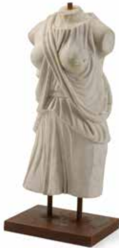
674 A CARVED MARBLE FEMALE TORSO W After the antique height 33in (83cm); width 14in (35cm); depth 10in (25cm) $2,500 - 3,500