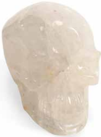
PROPERTY OF VARIOUS OWNERS 711 A ROCK CRYSTAL SKULL height 8 1/2in (21cm); width 7in (17cm); depth 9in (22cm) $2,000 - 3,000