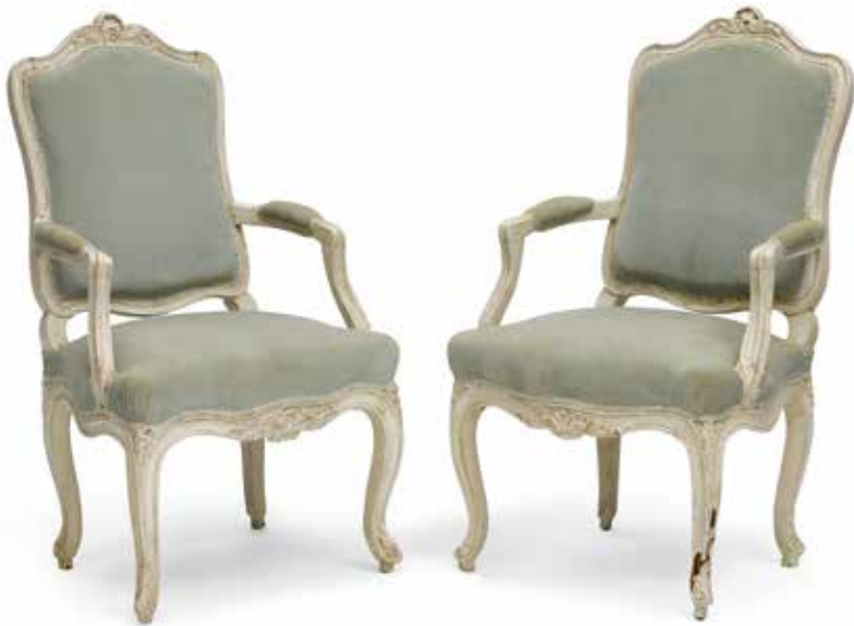
210 A PAIR OF LOUIS XV PAINTED AND CARVED WOOD FAUTEUILS W 18th century height 38 1/4in (97cm); width 22in (55cm); depth 27in (68cm) $1,500 - 2,000