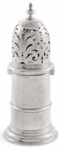
28 A QUEEN ANNE BRITANNIA STANDARD SILVER SUGAR CASTER by John Sutton, London, 1704 height 7 1/2in (19cm); total silver weight approximately 9oz troy. $800 - 1,200