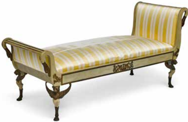
658 AN EMPIRE STYLE BRONZE MOUNTED PAINTED WOOD DAYBED W Late 19th/early 20th century height 25 1/2in (64cm); width 73in (185cm); depth 25 1/2in (64cm) $2,000 - 3,000