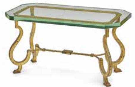
383 A FRENCH GLASS TOP GILT WROUGHT IRON COCKTAIL TABLE W Attributed to Maison Ramsey, circa 1960 height 18in (46cm); width 34in (86cm); depth 17in (43cm) $1,500 - 2,000