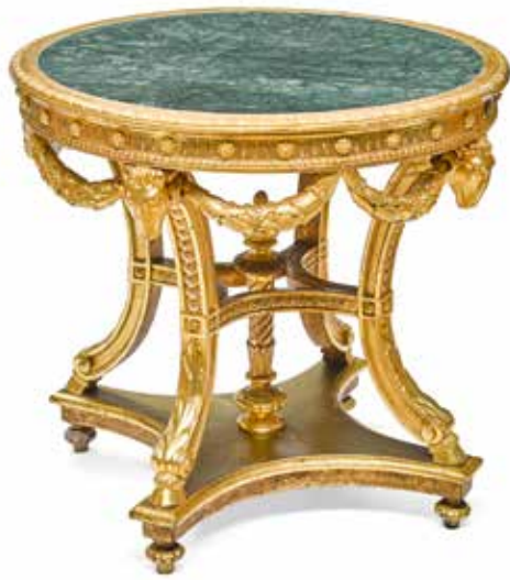
409 A RUSSIAN NEOCLASSICAL STYLE MARBLE TOP CARVED AND GILTWOOD TABLE W 19th century height 29in (73.6cm); diameter 31in (78.7cm) $2,500 - 3,500