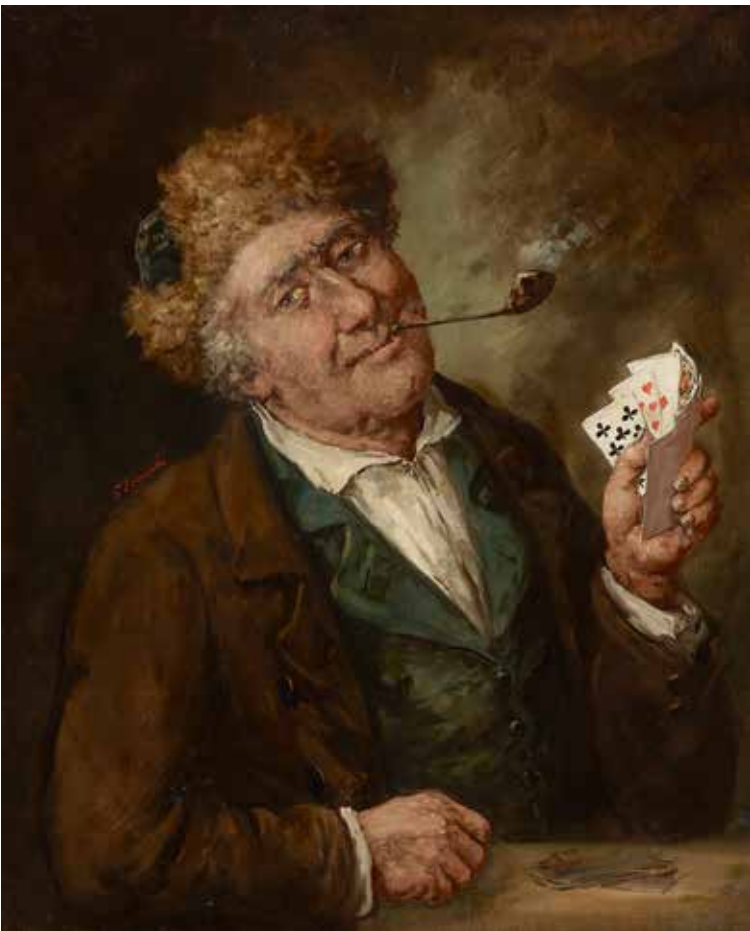
535 E. RENARD (CONTINENTAL, 19TH/20TH CENTURY) A good hand signed 'E Renard' (center left) oil on canvas 27 x 22in (68.7 x 56cm) $3,000 - 5,000