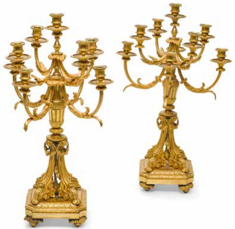
605 A PAIR OF LOUIS XVI STYLE GILT BRONZE NINE LIGHT CANDELABRA W Late 19th century height 25 1/4in (64cm) $4,000 - 6,000