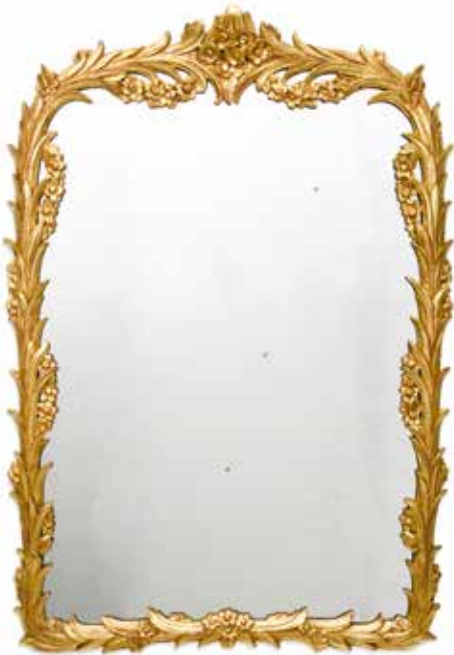
231 A GEORGE III STYLE CARVED GILTWOOD MIRROR W 19th century height 51in (129cm); width 35 1/2in (90cm) $2,500 - 3,500