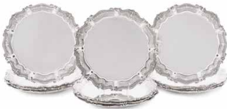
115 TWELVE ITALIAN SILVER PLATES with the mark of Buccellati, 20th Century Diameter 8in (20cm), total silver weight approximately 95oz troy. $3,000 - 5,000