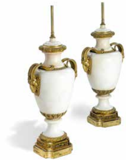
395 A PAIR OF LOUIS XVI STYLE GILT BRONZE W MOUNTED WHITE MARBLE URNS 19th Century Electrified. height including later giltwood plinth but excluding fitting 22 1/2in (57cm) $1,000 - 1,500