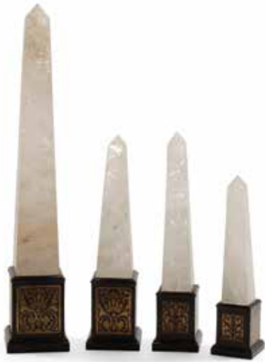
672 A SET OF FOUR GRADUATED FAUX TORTOISE SHELL AND ROCK CRYSTAL W OBELISKS heights 17in to 33in (33cm to 84cm) $4,000 - 6,000