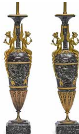
PROPERTY OF ANOTHER OWNER 426 A PAIR OF NEOCLASSICAL STYLE GILT BRONZE AND MARBLE URNS MOUNTED AS LAMPS W height 19 3/4in (50cm) $3,000 - 5,000