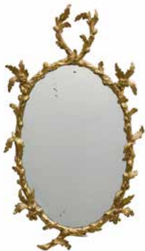
PROPERTY OF ANOTHER OWNER 399 GEORGE III STYLE GILTWOOD MIRROR W height 35in (88cm); width 19in (48cm) $800 - 1,200