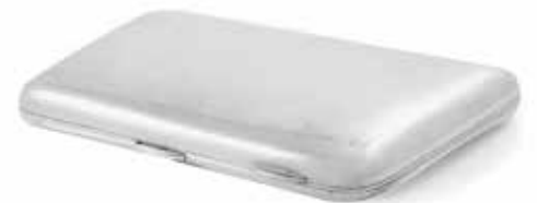
50 A ENGLISH STERLING SILVER COMPACT CASE, by Stokes & Ireland Ltd., Birmingham, 1911 With gilt-silver interior, length 5in (13cm); width 3 1/2in (9cm), total silver weight approximately 7oz troy. $1,500 - 2,000