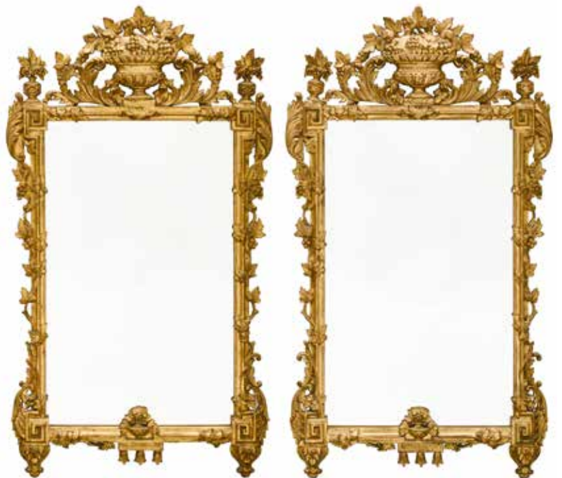
211 A PAIR OF LOUIS XVI STYLE GILTWOOD MIRRORS W 20th century height 58in (147cm); width 31 1/2in (80cm) $8,000 - 12,000