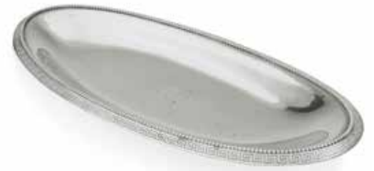
PROPERTY FROM THE PRIVATE COLLECTION OF COUNT JAN LEWENHAUPT 12 AN AMERICAN SILVER OVAL FISH PLATTER by W. K. Vanderslice & Co., San Francisco, CA, fourth quarter 19th century Monogram: CHC, en suite with the following five lots, height 2 1/4in (5.75cm), length 21in (53.25cm); weight approximately 53oz troy. $2,000 - 3,000