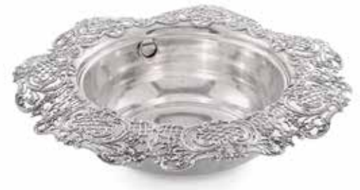
6 AN AMERICAN STERLING SILVER SERVING BOWL WITH PIERCED SCROLLING FOLIATE RIM by Shreve & Co., San Francisco, CA, 20th Century With a fitted silver liner, the diameter over the rim 14 1/2in (37cm), total weighable silver approximately 38oz troy. $2,000 - 3,000