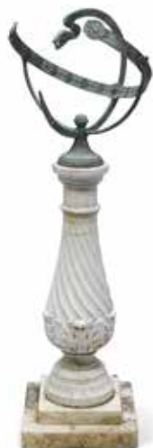
PROPERTY FROM AN OREGON ESTATE 564 OXIDIZED METAL SUNDIAL ON A CARVED MARBLE PEDESTAL W height overall 49in (124cm) $1,500 - 2,500