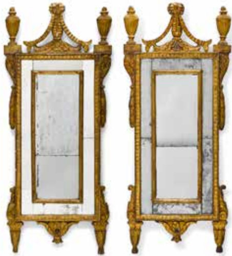
PROPERTY OF VARIOUS OWNERS 313 A PAIR OF ITALIAN NEOCLASSICAL GILTWOOD MIRRORS W 18th century and later height 58in (147cm); width 23 3/4in (60cm) $3,000 - 5,000