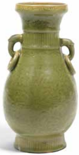
PROPERTY OF VARIOUS OWNERS 574 A CHINESE CELADON GLAZED EARTHENWARE HANDLED VASE 20th century height 14 7/8in (38cm) $1,000 - 1,500