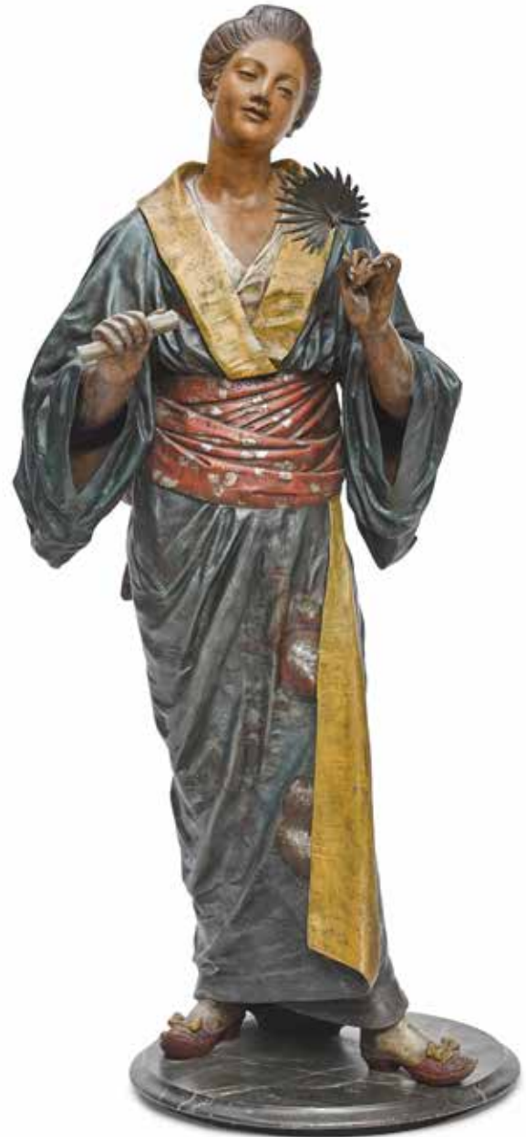
PROPERTY OF VARIOUS OWNERS 603 A CONTINENTAL POLYCHROME SPELTER LIFESIZE FIGURE OF A WOMAN IN A JAPANESE KIMONO 19th century Signed indistinctly. height 60in (153cm) $4,000 - 6,000