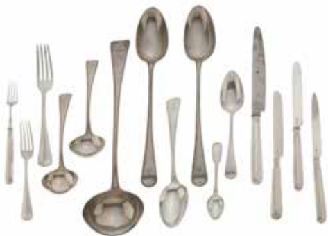
40 AN ASSEMBLED GEORGIAN STERLING SILVER PART FLATWARE SERVICE FOR EIGHTEEN by Richard Crossley and other makers, late 18th and early 19th Century Various patterns, all with matching heraldic engraving with two serving spoons, two soup ladles and a sauce ladle, total weight approximately 200oz troy (118) . $2,500 - 3,500