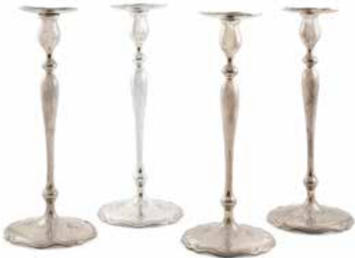
7 FOUR AMERICAN STERLING SILVER BASE LOADED CANDLESTICKS by Shreve & Co., San Francisco, CA, 20th century The pair of candle sticks each raised on a scalloped circular foot with reeded border, with a lobed baluster-form stem, terminating in a scalloped bobèche with reeded border, height 15in (38cm). $2,000 - 3,000