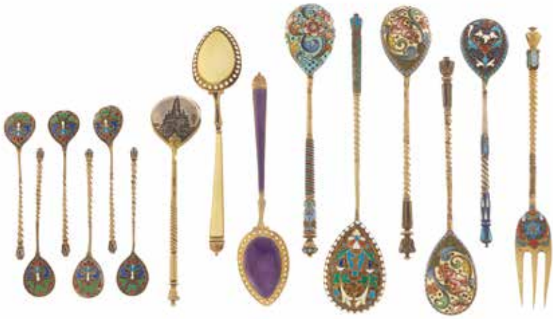
60 A GROUP OF THIRTEEN RUSSIAN SILVER AND ENAMEL SPOONS AND FORK by various makers, 19th century and later Together with two sterling silver and enamel spoons, the longest length 5 1/2in (14cm). $800 - 1,200