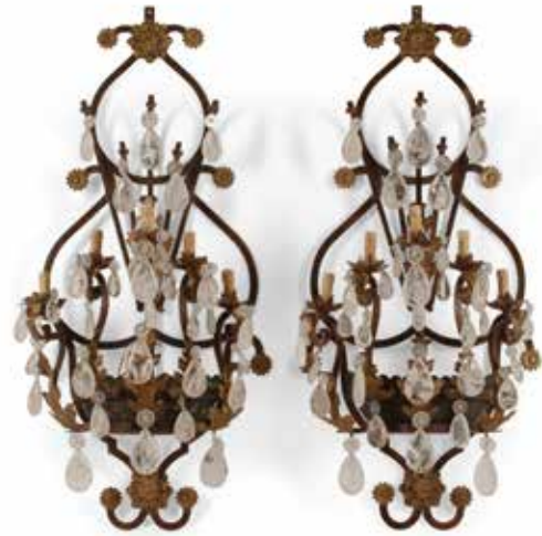
493 A PAIR OF ROCOCO STYLE GILT METAL AND ROCK CRYSTAL FOUR LIGHT WALL SCONCES W SCONCES height 51 1/2in (130cm); width 23in (58cm) $2,000 - 3,000