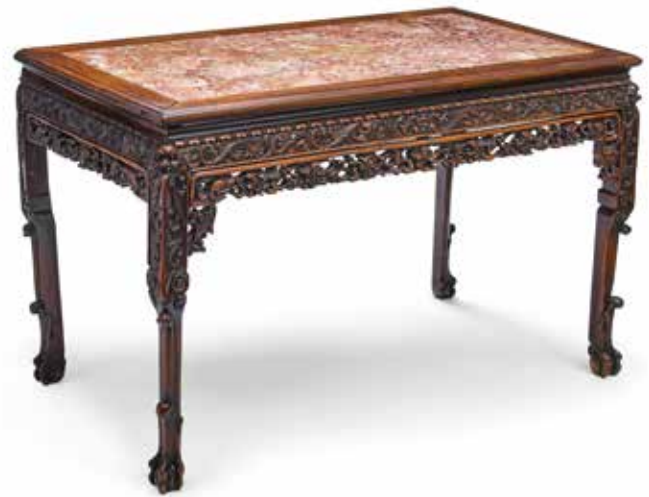
578 A CHINESE MARBLE INLAID TOP CARVED HARDWOOD CONSOLE W Circa 1900 height 32 1/4in (87cm); width 51in (129cm); depth 28in (71cm) $2,000 - 3,000