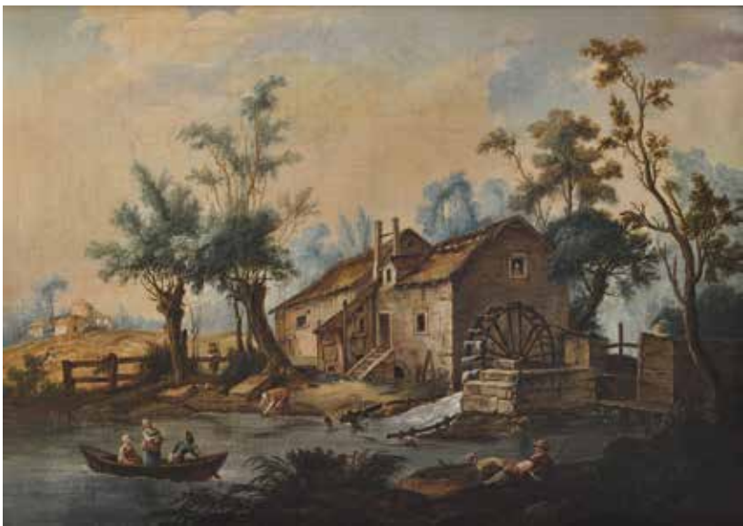
440 CONTINENTAL SCHOOL, 19TH CENTURY W A landscape with figures in a boat by a water mill oil on canvas 64 x 90in (162.5 x 228.6cm) $3,000 - 5,000