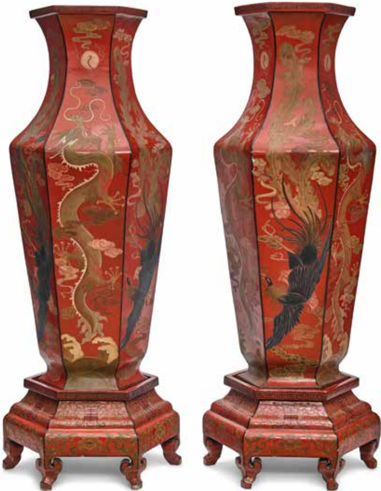
PROPERTY OF VARIOUS OWNERS 577 A PAIR OF LARGE JAPANESE RED LACQUERED VASES ON STANDS W Late 19th/early 20th century height 69in (175cm) $6,000 - 8,000