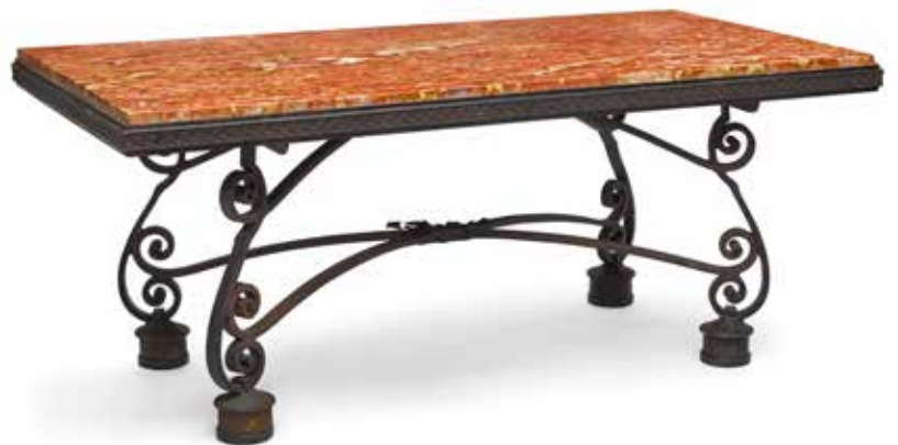
588 A MARBLE TOP WROUGHT IRON TABLE W 20th century height 31in (78cm); width 72in (182cm); depth 36in (91cm) $2,500 - 3,500