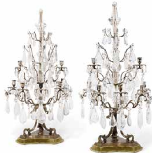
708 A PAIR OF FRENCH SILVERED BRONZE AND CUT AND MOLDED GLASS SEVEN LIGHT GIRANDOLES W 19th century On velvet bases. height overall 33 1/4in (84.5cm) height 32in $3,000 - 5,000