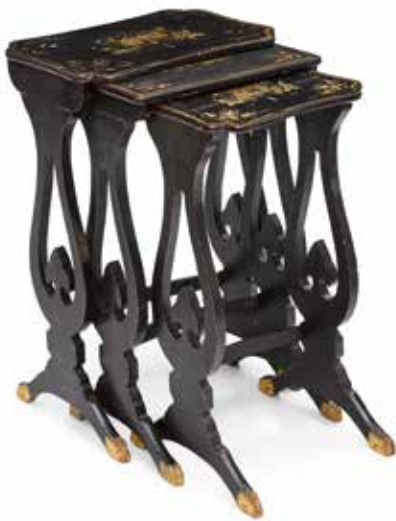
223 A NEST OF THREE CHINESE EXPORT GILT DECORATED AND BLACK LACQUERED WOOD TABLES W 19th century height of largest 27in (68cm); width 17in (43cm); depth 12in (30cm) $1,500 - 2,000