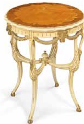
PROPERTY OF A PRIVATE SAN FRANCISCO BAY AREA COLLECTOR 316 AN ITALIAN NEOCLASSICAL STYLE MARQUETRY TOP PARCEL GILT AND PAINTED CENTER TABLE W Second quarter 20th century height 29 3/4in (75.5cm); diameter 23in (58.5cm) $800 - 1,200