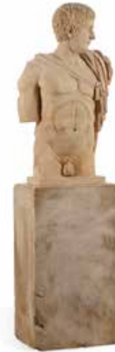
PROPERTY OF ANOTHER OWNER 563 A ROMAN STYLE CARVED STONE MALE TORSO ON PEDESTAL W After the antique height of figure 39in (99cm); width 23in (58cm); depth 12in (30cm); height of pedestal 36in (91cm); width 20in (50cm); depth 16in (40cm) $4,000 - 6,000