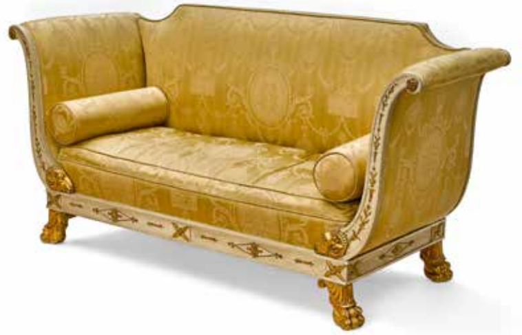
657 AN EMPIRE PARCEL GILT AND PAINTED WOOD SOFA W 19th century height 35in (88cm); width 73in (185cm); depth 25 1/4in (64cm) $2,500 - 3,500