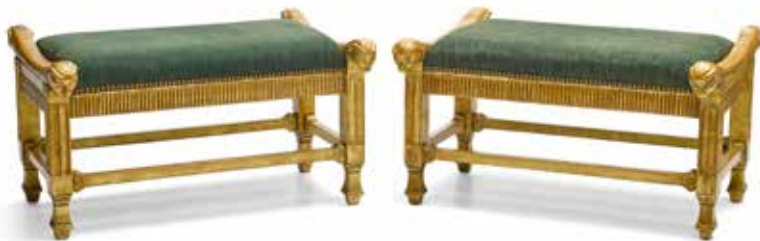
315 A PAIR OF NEOCLASSICAL STYLE CARVED GILTWOOD AND UPHOLSTERED BENCHES W Circa 1934 height 17 1/2in (44.5cm); width 31in (78.5cm); depth 23in (58cm) $1,500 - 2,000