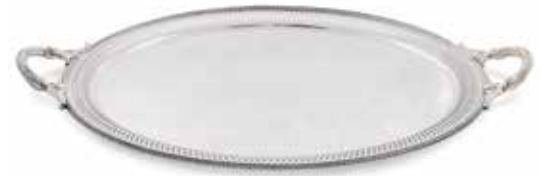
46 AN ENGLISH STERLING SILVER TWO-HANDLED PRESENTATION TRAY by Thomas Bradbury & Sons (Joseph & Edward Bradbury), London, 1864 With reticulated rim, and central engraved presentation from 1874, length over handles 31 1/2in (80cm), total silver weight approximately 150oz troy. $3,000 - 5,000