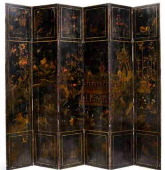
PROPERTY FROM AN OLD CALIFORNIA FAMILY COLLECTION 225 A CHINESE POLYCHROME DECORATED AND BLACK LACQUERED FOUR-PANEL SCREEN W 19th century height 101in (256cm); width of each panel 19 1/2in (49cm) $1,500 - 1,800