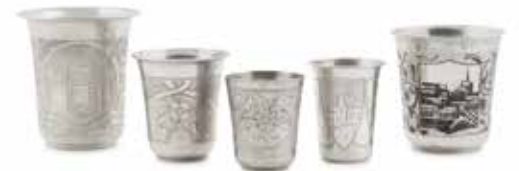
59 PROPERTY OF VARIOUS OWNERS FIVE RUSSIAN ETCHED SILVER CUPS by various makers, 19th century Total silver weight approximately 7.5oz troy. $800 - 1,200