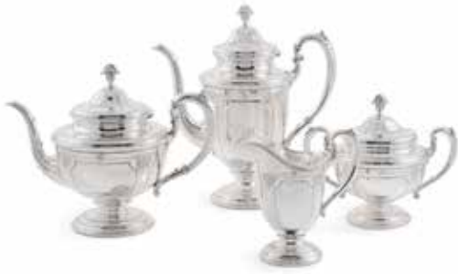
1 AN AMERICAN STERLING SILVER FOUR PIECE TEA AND COFFEE SET by Towle Silvermiths, Newburyport, MA, 20th Century Louis XIV pattern, the coffee pot height 11in (28cm), total silver weight approximately 70oz troy. $1,500 - 2,000