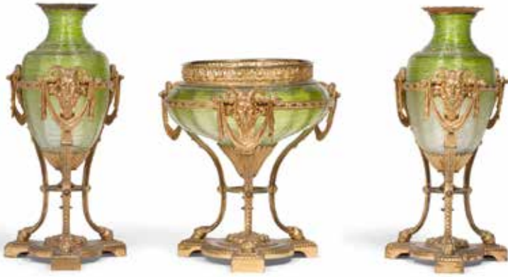
PROPERTY FROM AN OREGON ESTATE 709 A NEOCLASSICAL STYLE GILT METAL AND THREADED GREEN GLASS THREE PIECE TABLE GARNITURE Comprising a pair of urns and a bowl. height of urns 13 1/8in (33.5cm); diameter of bowl 9 5/8in (24cm) $1,000 - 1,500