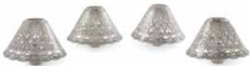
PROPERTY OF VARIOUS OWNERS 16 A SET OF FOUR AMERICAN STERLING SILVER PIERCED CANDLE SHADES marked Tiffany & Co. 17579A, 20th century Together with four silver candle holders. $1,200 - 1,800