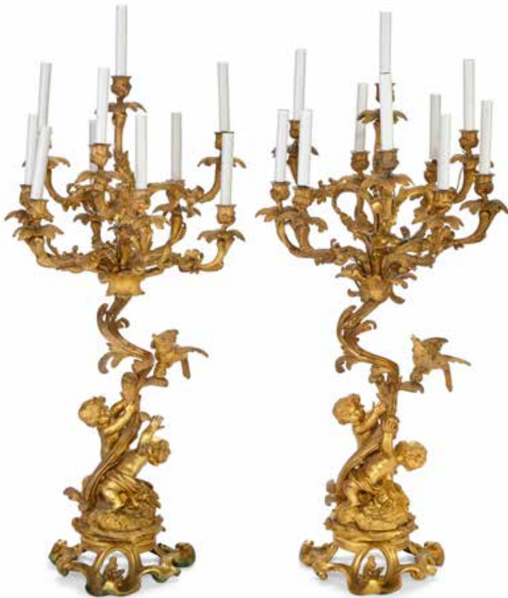
PROPERTY OF A PRIVATE SAN FRANCISCO BAY AREA COLLECTOR 606 A PAIR OF NAPOLEON III GILT BRONZE FIGURAL TEN LIGHT CANDELABRA W Third quarter 19th century Now electrified. height excluding electrical fittings 35 1/2in (90cm) $4,000 - 6,000