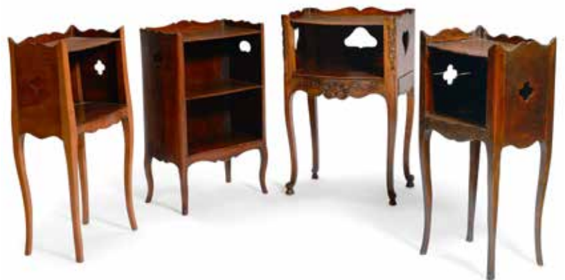
424 A GROUP OF FOUR LOUIS XV STYLE WALNUT SIDE TABLES W height of largest 31in (78cm); width 20in (50cm); depth 14 1/4in (36cm) $1,500 - 2,500