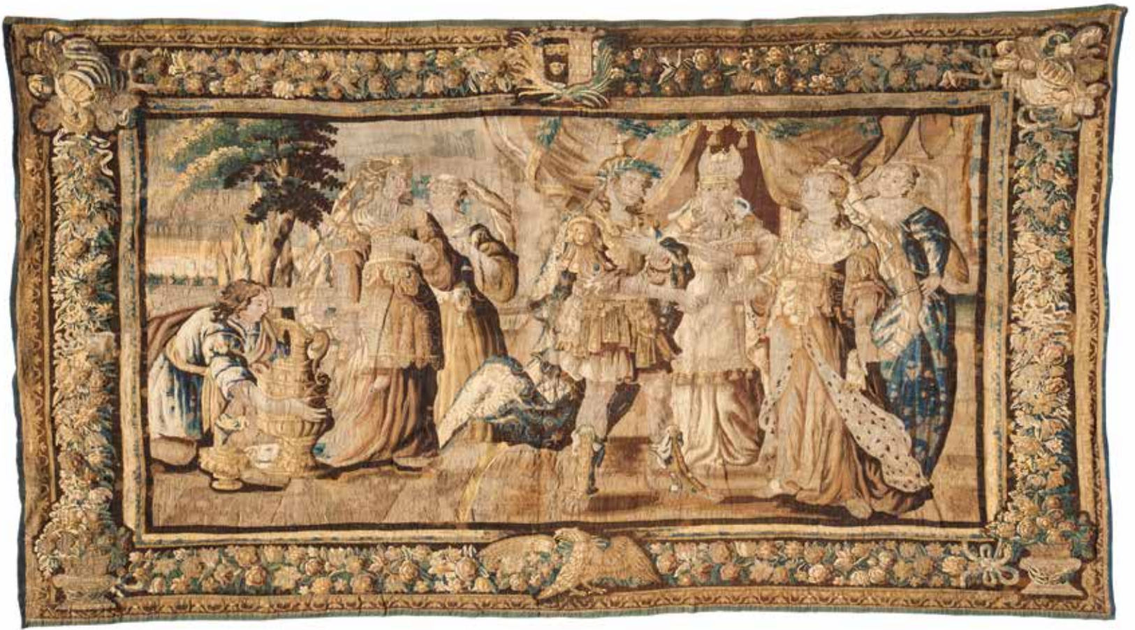
245 A FLEMISH WOOL HISTORICAL TAPESTRY: THE BETROTHED W 17th century dimensions 13ft 10in x 9ft 8in (422cm x 295cm) $12,000 - 18,000