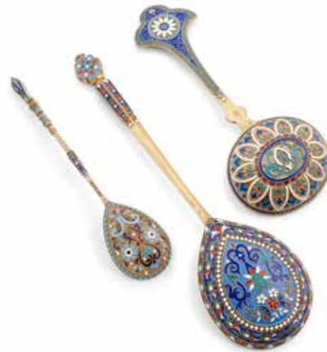
63 THREE RUSSIAN SILVER AND ENAMEL SPOONS by various makers, late 19th and early 20th century Comprising: an enamel silver gilt spoon by Khlebnikov 1893, an enamel caviar spoon, and an enamel silver teaspoon, length of the largest spoon 8in (20cm). $1,500 - 2,000