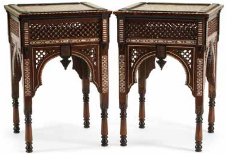
590 A PAIR OF LEVANTINE STYLE BONE INLAID HARDWOOD TABLES W 20th century height 33in (83cm); width 22in (55cm); depth 21 3/4in (55cm) $3,000 - 5,000