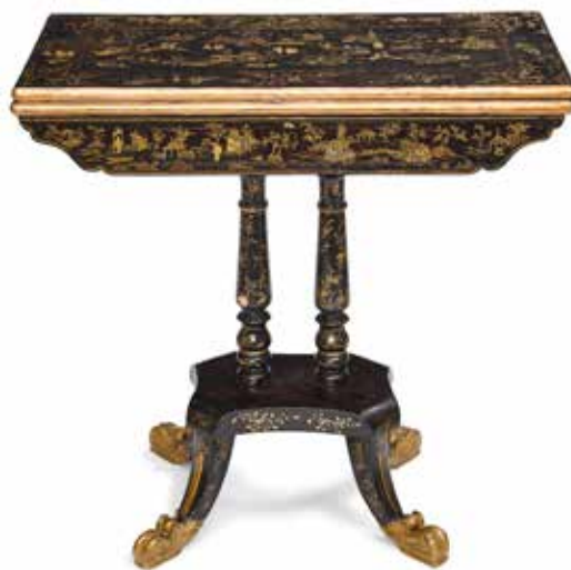
224 A CHINESE EXPORT GILT DECORATED BLACK LACQUERED GAMES TABLE W Early 19th century height 30 3/4in (78cm); width 31in (38cm); depth closed 15 1/4in (38cm) $2,500 - 3,500