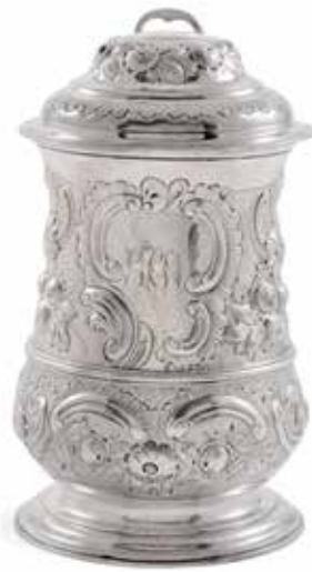
52 PROPERTY OF VARIOUS OWNERS A GEORGE III STERLING SILVER TANKARD by Thomas Whipham & Charles Wright, London, 1760 Repair to lid, later embellished, height 8in (20cm); total silver weight approximately 24oz troy. $800 - 1,200