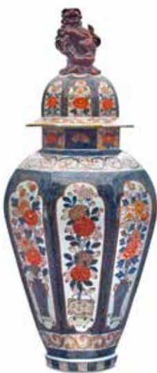
713 A JAPANESE IMARI PORCELAIN COVERED VASE W height 37 1/2in (95cm) $2,500 - 3,500