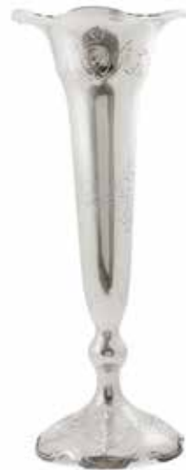
14 AN IMPRESSIVE AMERICAN WEIGHTED STERLING SILVER TRUMPET VASE W by Shreve & Co., San Francisco, CA, circa 1910 Undulating rim with hand-hammered border, chased foliate pattern to the body, over a domed foot with corresponding border and chasing, height 24in (61cm). $1,500 - 2,500