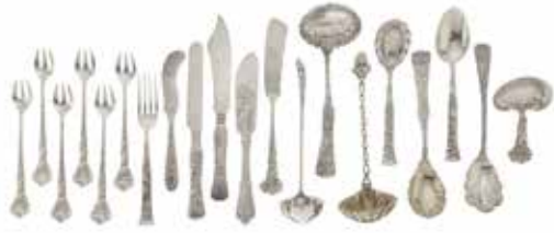
25 AN AMERICAN STERLING SILVER GROUPING OF ASSORTED FLATWARE AND SERVING WARE by Tiffany & Co., New York, NY, 20th century Various patterns, total silver weight approximately 27oz troy (20). $1,000 - 1,500