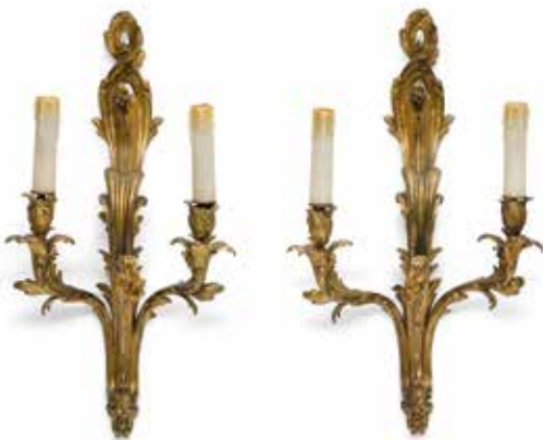
494 A PAIR OF FRENCH GILT BRONZE TWO LIGHT WALL SCONCES W SCONCES height 27 1/2in (70cm); width 15 1/2in (39.5cm) $1,000 - 1,500