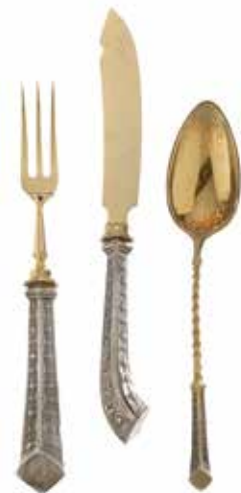
PROPERTY FROM THE FAMILY OF ERNST A. H. FRIEDHEIM 82 A GERMAN 800 STANDARD SILVER DESSERT FLATWARE SET FOR SIX by Koch & Bergfeld, Bremen, Germany, Circa 1884 Comprising six knives, six forks, and six spoons, total weighable silver approximately 17oz troy. $800 - 1,200