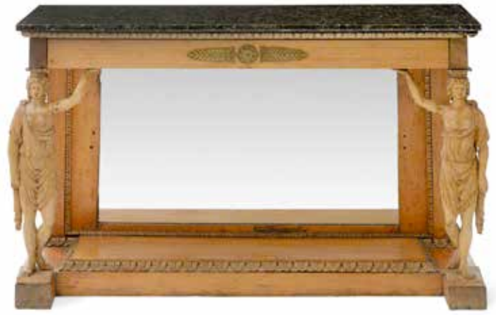
PROPERTY FROM AN OREGON ESTATE 312 A NEOCLASSICAL STYLE MARBLE TOP CARVED PINE CONSOLE W 19th century height 33 1/2in (85cm); width 53in (134cm); depth 17in (43cm) $3,000 - 5,000