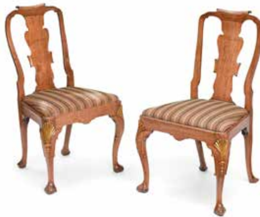
PROPERTY FROM AN IMPORTANT OREGON PRIVATE COLLECTION 232 A PAIR OF GEORGE II PARCEL GILT AND CARVED WALNUT SIDE CHAIRS W Second quarter 18th century height 39 1/2in (100cm); width 21 1/2in (54.5cm); depth of seat 16in (40.5cm) $600 - 800