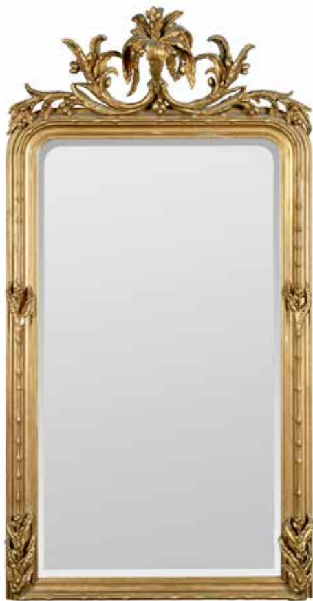
PROPERTY FROM AN OREGON ESTATE 725 AN ITALIAN ROCOCO STYLE GILT AND PAINTED WOOD MIRROR W 19th century height 86in (218cm); width 44in (111cm) $2,500 - 3,500