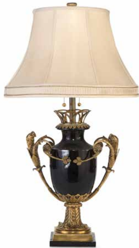
PROPERTY OF A PRIVATE SAN FRANCISCO BAY AREA COLLECTOR 741 A LOUIS XVI STYLE GILT BRONZE MOUNTED BLACK MARBLE URN FORM LAMP W Frederick Cooper, Chicago height excluding shade 25in (63.5cm); height including shade 38 1/4in (97cm) $800 - 1,200