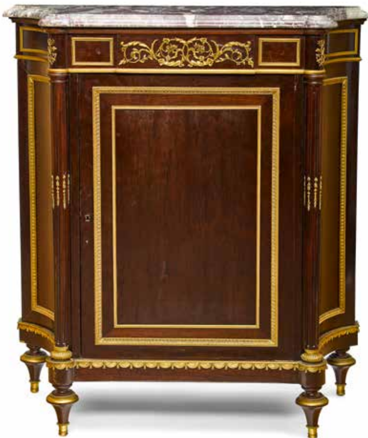
642 A LOUIS XVI STYLE MARBLE TOP GILT BRONZE MOUNTED MAHOGANY MEUBLE W DE APPUI height 43 1/2in (110cm); width 40in (101cm); depth 16 3/4in (42cm) $3,000 - 5,000