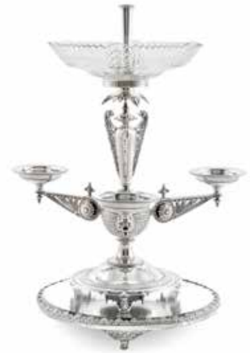
47 AN ENGLISH STERLING SILVER AND CUT GLASS EPERGNE by Horace Woodward & Co., London, 1879 Together with a footed silver plateau with a beveled mirrored glass insert, the plateau diameter 10in (25cm), total height of epergne 19in (49cm), silver weight of epergne approximately 50oz troy. $3,000 - 5,000