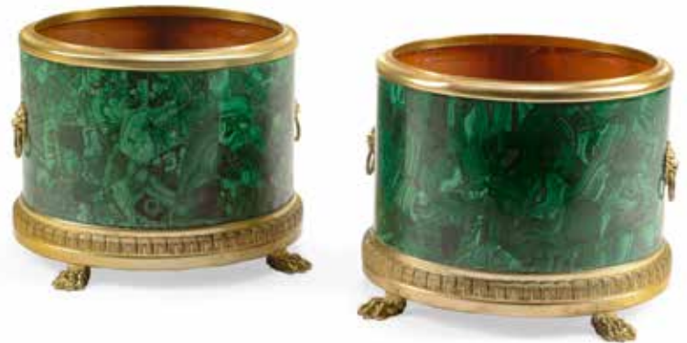
408 A PAIR OF NEOCLASSICAL STYLE GILT BRONZE AND MALACHITE PLANTERS height 11 1/2in (29cm); width 16in (40cm) $4,000 - 6,000