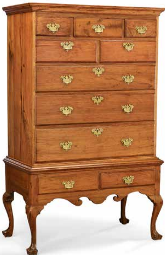
457 AN AMERICAN CHIPPENDALE WALNUT CHEST ON STAND W Pennsylvania, mid-18th century height 77in (195.5cm); width 41 1/2in (105.5cm); depth 23in (58.5cm) $4,000 - 6,000