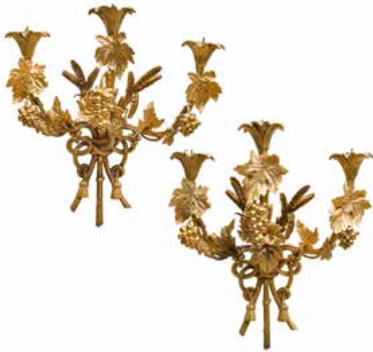
PROPERTY OF VARIOUS OWNERS 492 A PAIR OF GILT BRONZE ROPE BOUND GRAPE AND WHEAT SCONCES W Electrified. height 35 1/2in (90cm); width 29in (74cm) $3,000 - 5,000