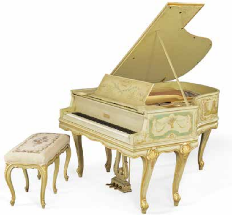
PROPERTY OF A PRIVATE SAN FRANCISCO BAY AREA COLLECTOR 724 A WILLIAM KNABE AND COMPANY LOUIS XV STYLE PAINT DECORATED SMALL GRAND PIANO; TOGETHER WITH AN ASSOCIATED PIANO BENCH W Second half 20th century Serial Number 86329. height of piano 40 1/2in (103cm); length 66in (168cm); width 59in (150cm); height of bench 21 1/2in (55cm); width 36in (91.5cm) $2,000 - 3,000