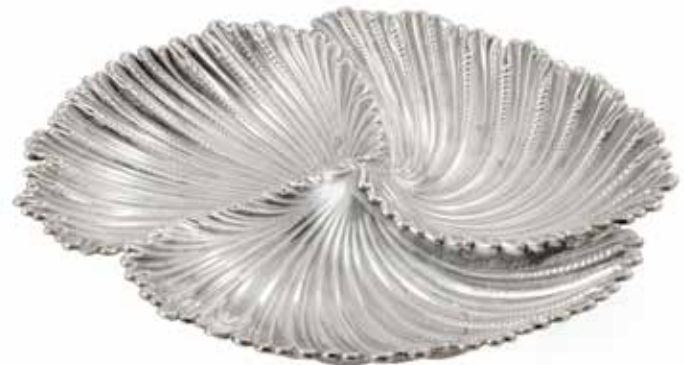
128 AN ITALIAN STERLING SILVER TRI-FORM FOLIATE DISH by Clementi Fabbrica Argenteria, Bologna, with the mark of Gianmaria Buccellati, 20th century Diameter 8in (21cm), total silver weight approximately 9oz troy. $800 - 1,200