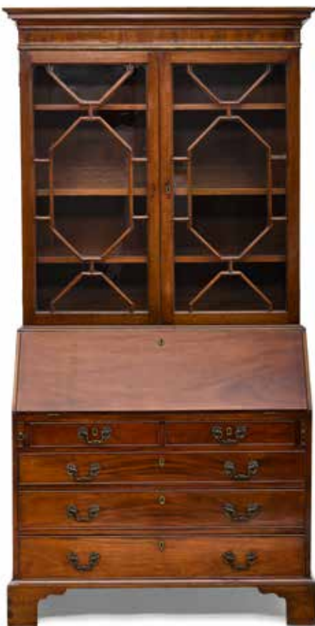
515 A GEORGE III MAHOGANY SECRETARY BOOKCASE W Late 18th century height 85in (215cm); 41 1/2in (105cm); depth 22 1/2in (57cm) $3,000 - 5,000