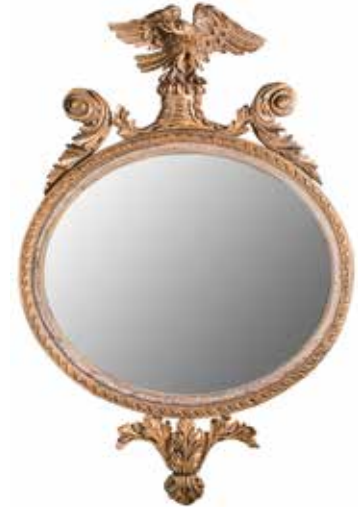
PROPERTY FROM A BEL AIR ESTATE 398 A GEORGE III STYLE PAINTED, GILT AND CARVED W WOOD MIRROR 20th Century height 53in (134cm); width 35in (88cm) $1,000 - 1,500