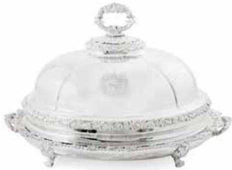
PROPERTY OF VARIOUS OWNERS 37 A GEORGIAN SILVERPLATE FOOTED MEAT DISH AND DOME 19th century Engraved with a heraldic crest, length over handles 26in (67cm) . $2,000 - 3,000